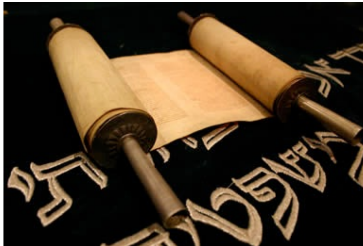
Yahshua's Flight map!

The Almighty saw to it that His 'flight map' was written, preserved and available when He was born into this world as a man!