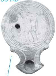
Gladiator Oil Lamp 100 AD