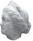
Head of a Goddess 100 BC