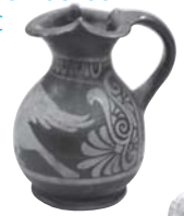
Trefoil Oinochoe 300 BC