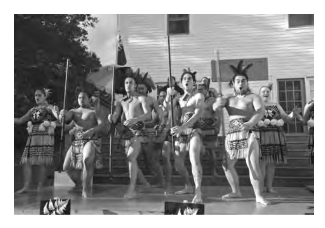
New Zealand Maori dance.

The original inhabitants of what is today known as New Zealand were Polynesians who arrived in a series of migrations more than 1,000 years ago. They named the land Aotearoa, or land of the long white cloud. The original inhabitants' societies revolved around the iwi (tribe) or hapu (subtribe), which served to differentiate the many tribes of peoples. In 1642, the Dutch explorer Abel Janszoon Tasman sailed up the west coast and christened the land Niuew Zeeland after the Netherlands' province of Zeeland. Later, in 1769, Captain James Cook sailed around the islands and claimed the entire land for the British crown. It was only after the arrival of the Europeans that the term Māori was used to describe all the tribes on the land. Those labeled Māori do not necessarily regard themselves as a single people.