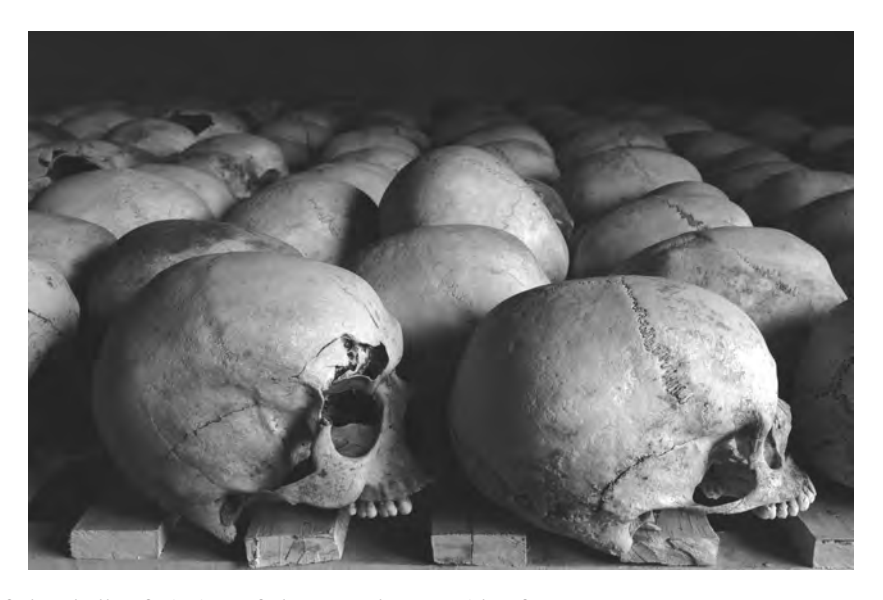
Rows of the skulls of victims of the Rwanda genocide of 1994