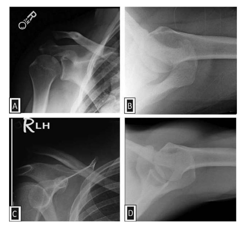
Figure 1 Anteroposterior (A) and axial (B) radiographs showing a Rockwood type III dislocation. Anteroposterior (C) and axial (D) radiographs showing a Rockwood type V dislocation.

This was an evaluation study looking at the interobserver and intraobserver reliability of the Rockwood classification system. A member of the coding department retrospectively identified 200 patients with AC joint injuries using the International Classification of Diseases, Ninth Revision code 831.04. Once a patient was identified, a member of our radiology staff reviewed the radiographs to