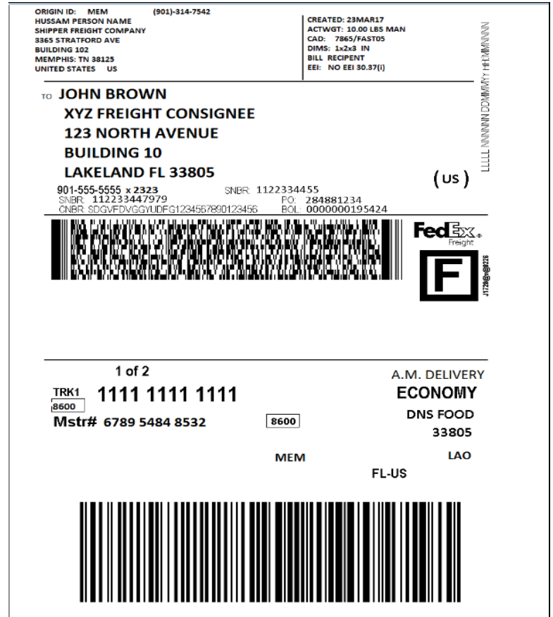
Pallet shipping label

Please note: Freight shipments are changing to a 12-digit tracking number from a 9-digit tracking number.