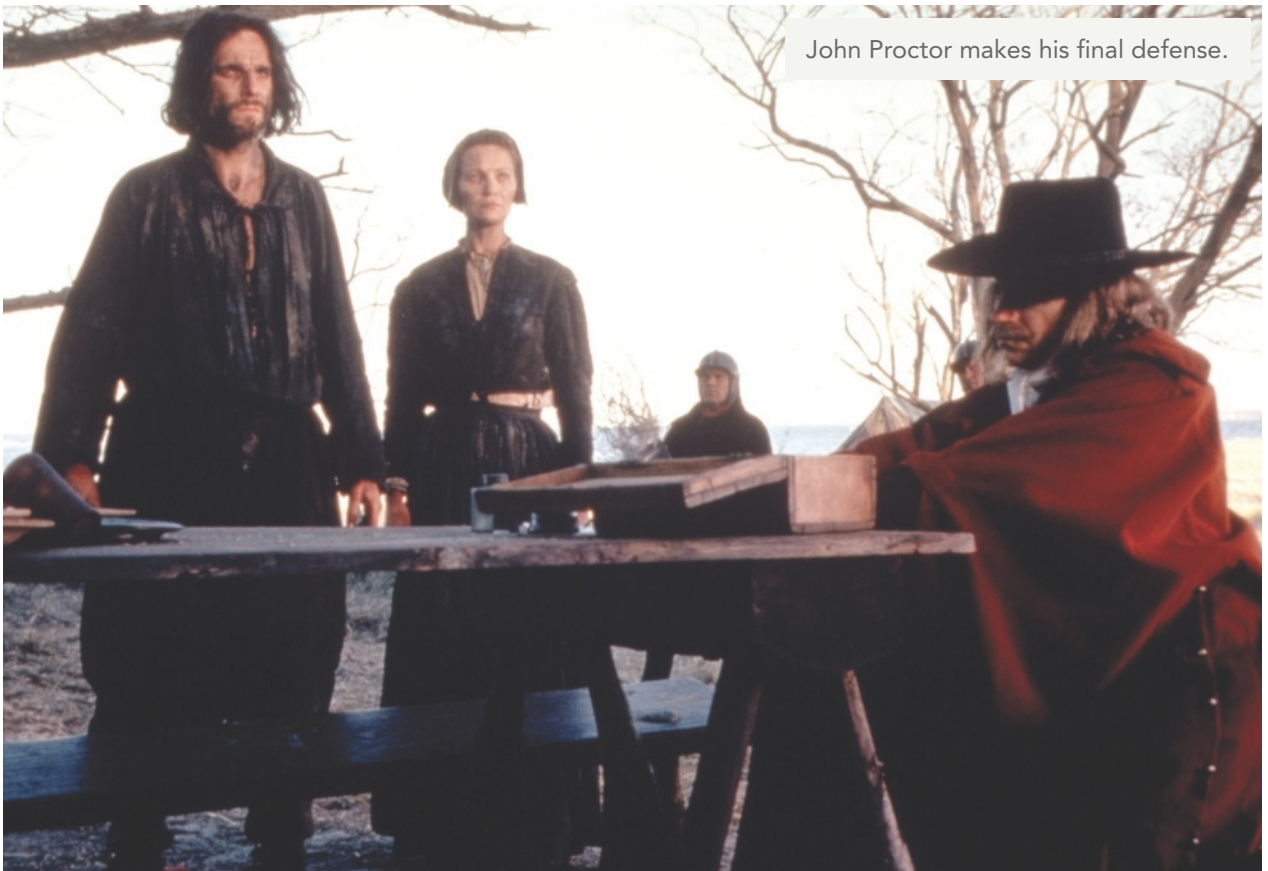
John Proctor makes his final defense.