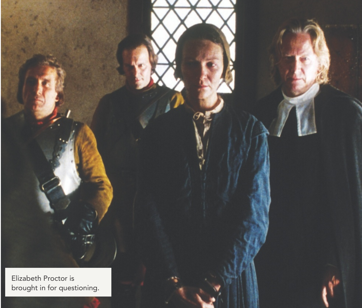
Elizabeth Proctor is brought in for questioning.