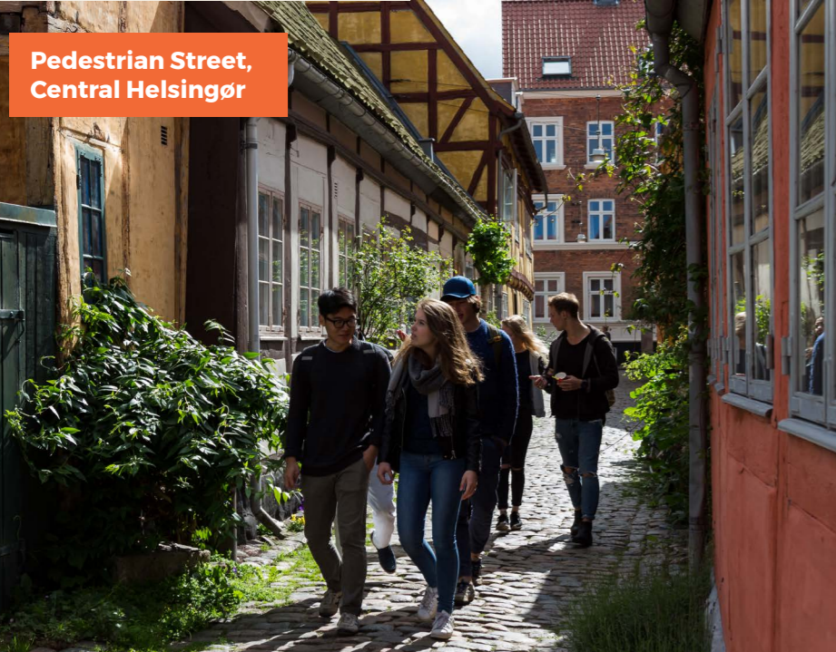
Pedestrian Street, Central Helsingør