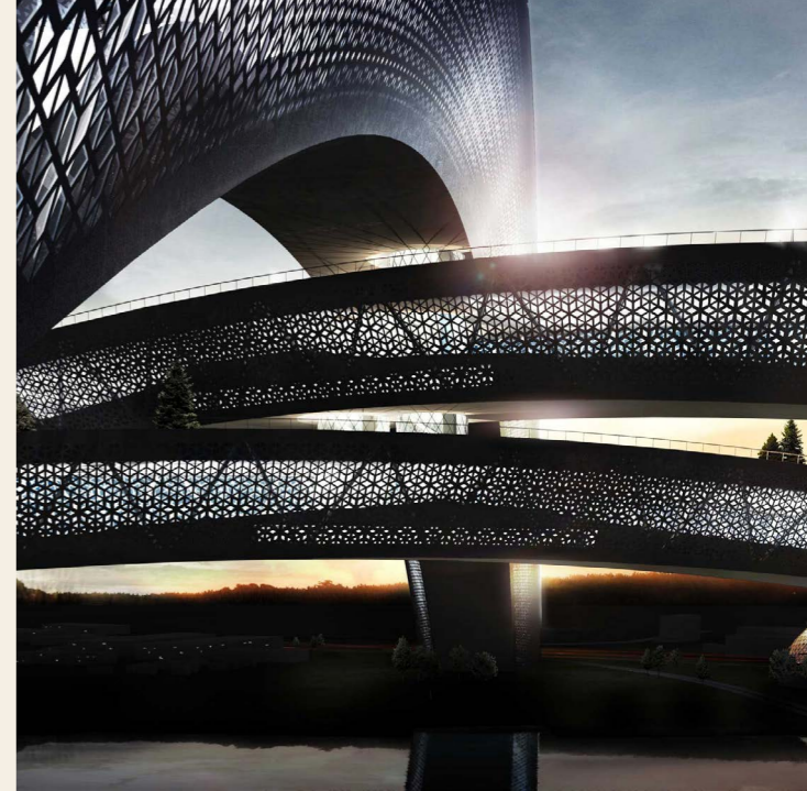
World's largest sky dome - Cebra Architects, Randers, DK

Our lectures in Danish Culture and Society offers insights into how and why Danish design has received such international recognition.