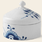
BonBon Bowl by Royal Copenhagen