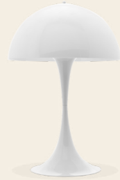
Panthella Lamp by Louis Poulsen