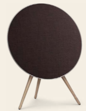
BeoPlay A9 Speaker by Bang & Olufsen