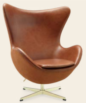
The Egg by Arne Jacobsen