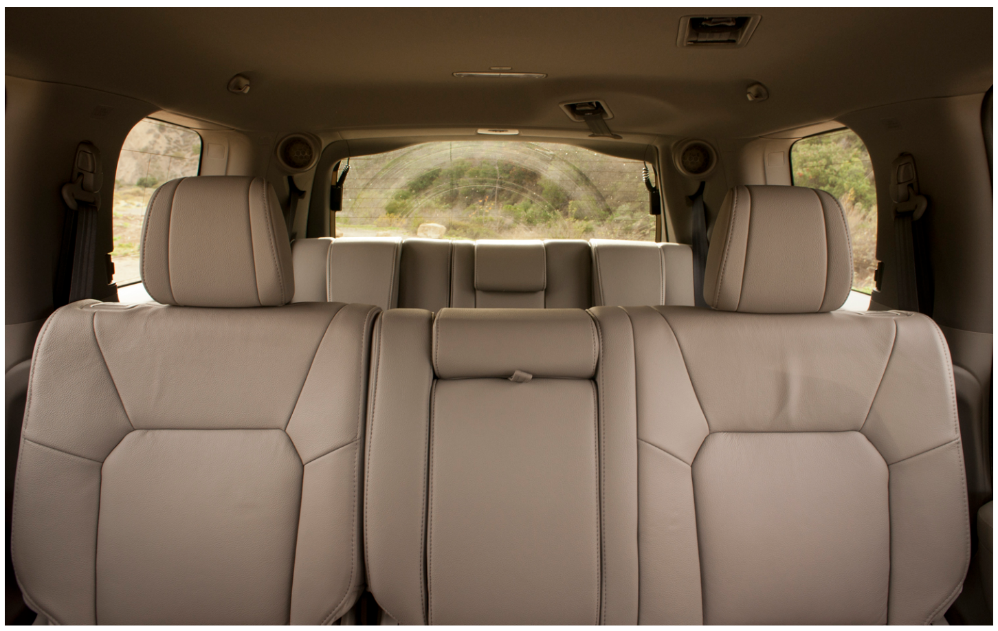
Rapidcarloans.net is the online auto financing company that gets you low rate car loans for buying a new car or a used car. Our auto loan programs are designed for.

CAR BUYING GUIDE. Buying a New or Used car can be one of the most chaotic, intimidating, and