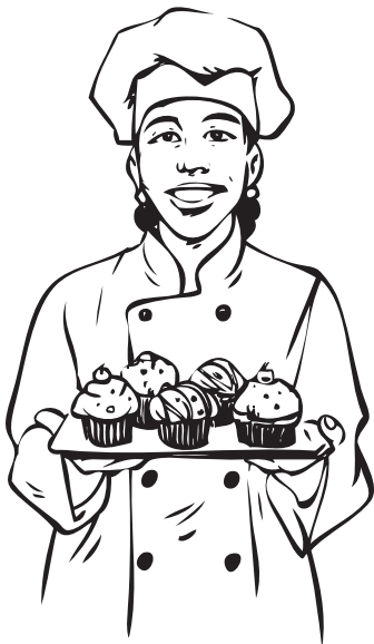
SMALL GROUP LEADER