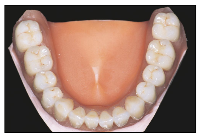
Figure 9. The completed mandibular restorations were subsequently placed on a soft tissue cast.