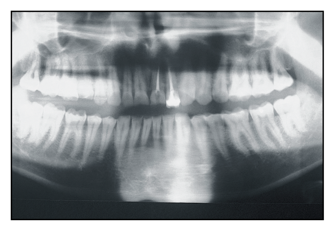
Figure 2. No legend submitted.

When a patient is examined for the first time, it is difficult for the clinician to determine if the rate of wear is excessive. The patient must be monitored over a period of time so the rate of wear can be assessed to a certain degree. It is also difficult for the clinician to make comparisons with "normal" wear rates since conflicting values are described in various published articles. For example, one study reports a normal loss of enamel between 20 \mu m and 38 \mu m per year,<sup>1</sup> whereas another study reports a wear of 65 \mu m in 6 months.<sup>2</sup> These conflicting data could be due to the variable ages of the patients used in these evaluations.