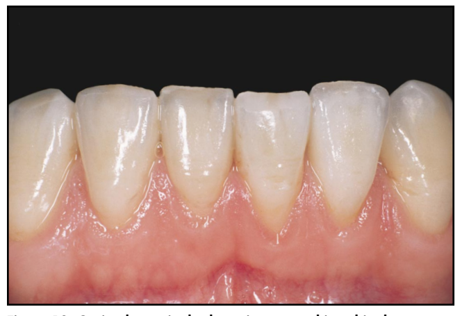
Figure 13. Optimal marginal adaptation was achieved in the presence of thin periodontium. Note the healthy appearance of the mandibular soft tissues.