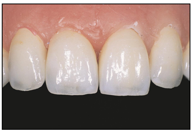
Figure 10. The restorations were evaluated prior to delivery to determine the degree of translucency.

Although limited-wear lesions may be treated using direct restorations, a complex prosthodontic rehabilitation may be necessary to re-create the integrity of the dentition when the extent of the erosion leads to severe limitation of function and aesthetics. All-ceramic restorations are used with increasing frequency when aesthetics is of concern. While acceptable results can be achieved using metal-ceramic alternatives, their lack of light transmission may unnecessarily darken the root and increase the need for less conservative subgingival margin placement.<sup>12,13</sup>