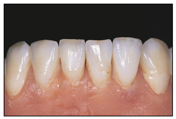
Figure 11. Placement of internal characteristics and surface irregularities allowed development of a more natural appearance.

Diagnostic waxups were prepared to precisely calculate the correct proportion of teeth and achieve an acceptable occlusal scheme. The waxup was also used to allow the patient to visualize the anticipated postoperative outcome. Provisional restorations were fabricated according to the diagnostic waxup at the planned increase of VDO. The incisal guide table was fabricated to reproduce the protrusive and excursive movements.