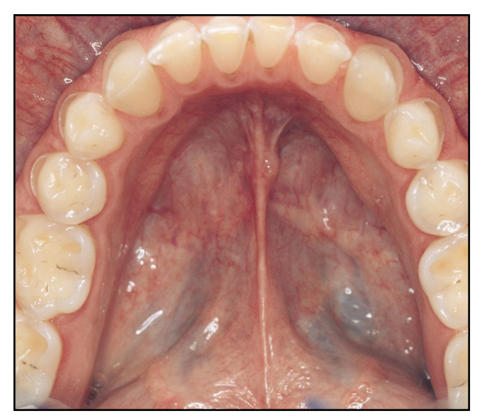
Figure 4. Preoperative occlusal view of the worn mandibular dentition.