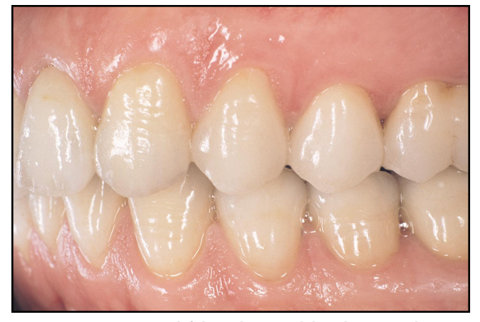
Figure 15. Postoperative left lateral view exhibits the restored occlusal plane and vertical dimension of occlusion in maximum intercuspation.