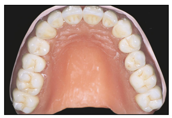
Figure 8. The definitive maxillary porcelain crown restorations (IPS Empress II, Ivoclar Vivadent, Amherst, NY) were fabricated and placed on a soft tissue cast to evaluate their occlusal appearance.