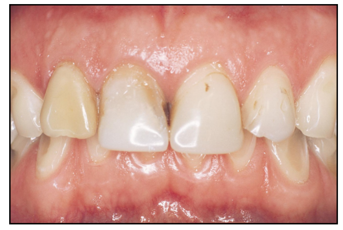
Figure 1. Preoperative view of the unaesthetic anterior dentition.

In order to successfully manage a patient with extensively worn dentition, the clinician must have a thorough understanding of the etiology and presentation of tooth surface loss. Although tooth wear is often caused by a combination of various etiological factors, one factor may often predominate. Clear communication between the dentist and the patient is, therefore, essential in the identification of the etiology of erosion. The patient must be made aware of the existing condition and the various forms of prevention and management. This article reviews the etiology and development of erosion prior to aesthetic treatment using all-ceramic restorations.