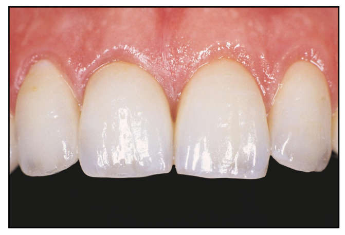
Figure 12. Postoperative facial view of the definitive restorations demonstrates tooth vitality and optimal integration.

The maxillary and mandibular arches were initially restored using a composite resin material in one visit. A general occlusion was provided until tooth preparations could be completed the next day. In order to increase VDO and to provide occlusal stability, the maxillary and mandibular teeth were prepared in one appointment. Anesthesia was delivered, and rounded shoulder margins were prepared for all the teeth. The mandibular incisors were prepared with narrower shoulders (0.8 mm), while the molars and maxillary incisors were reduced with 1-mm shoulders (Figure 7).