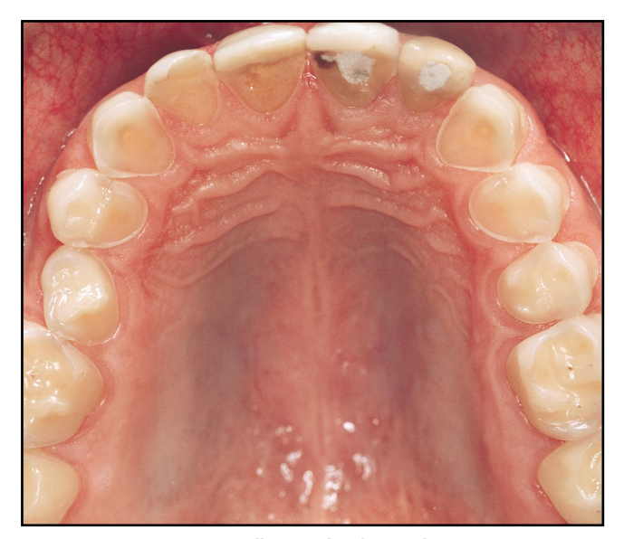
Figure 3. Preoperative maxillary occlusal view demonstrates severely rounded incisors.

Noncarious tooth surface loss is a normal physiologic process that occurs in many patients throughout life.<sup>3</sup> If the rate of wear is such that it is a source of concern to the patient, or if it is likely to prejudice the survival of the teeth, then the rate is considered to be pathological, and action must be taken to minimize the damage.<sup>4,5</sup>