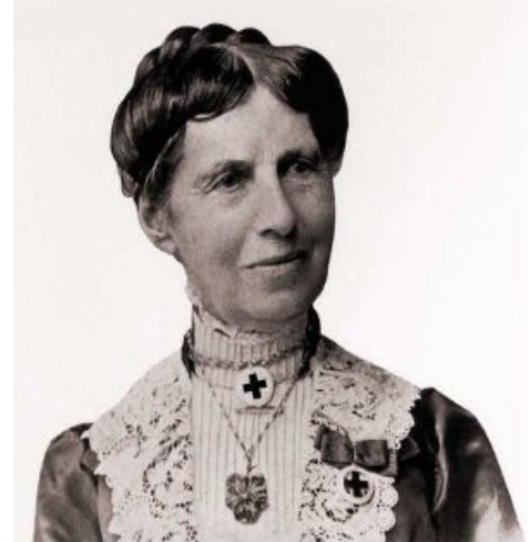
This photo of Clara Barton was taken in 1902.

Clara wasn't finished helping when the war was over. Clara headed a group that searched for missing soldiers. This group also worked to identify the graves of