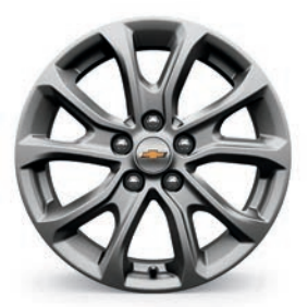
17" Painted-Aluminum (Standard on L, LS and LT)