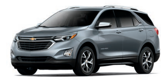
SATIN STEEL METALLIC<sup>2</sup>