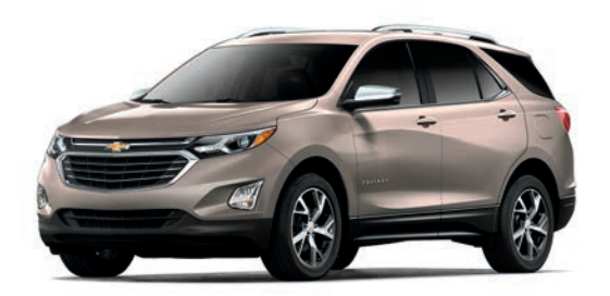
SANDY RIDGE METALLIC<sup>4</sup>