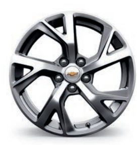
18" Machined-Face Aluminum with Painted Pockets (Standard on LT with 2.0L engine and Premier with 1.5L or 1.6L Diesel engine)