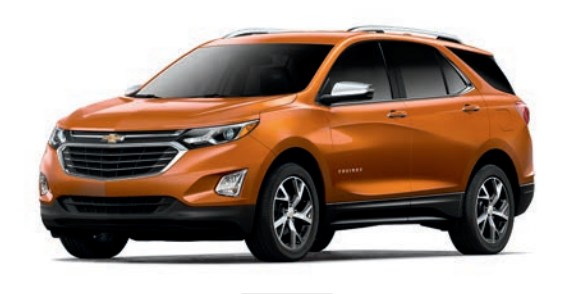
ORANGE BURST METALLIC<sup>1,3,4</sup>