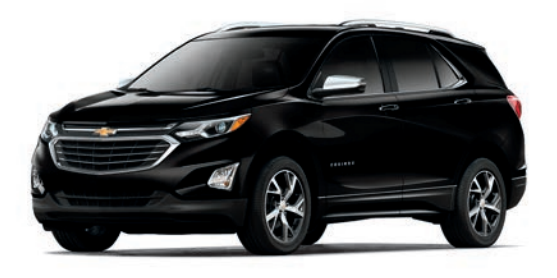
MOSAIC BLACK METALLIC<sup>2</sup>