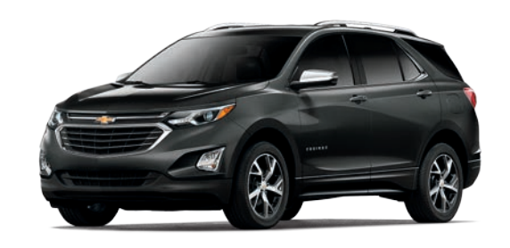
NIGHTFALL GRAY METALLIC4