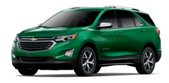
IVY METALLIC1, 3, 4, 5