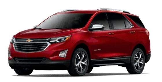
CAJUN RED TINTCOAT<sup>1, 2, 5</sup>