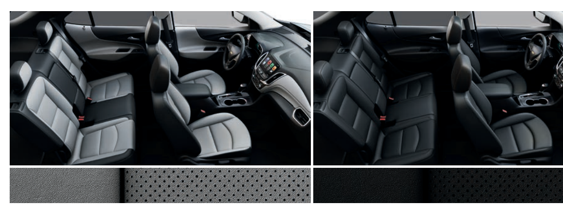
Jet Black/Medium Ash Gray Perforated Leather Appointments<sup>1</sup>