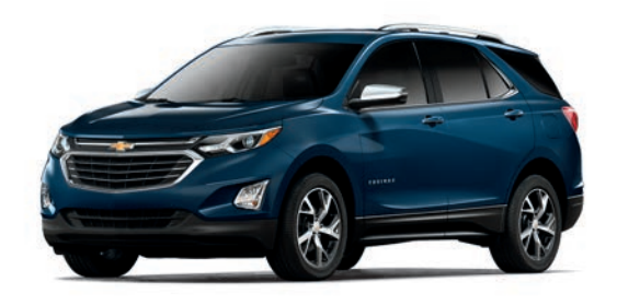
STORM BLUE METALLIC<sup>4</sup>