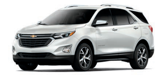
IRIDESCENT PEARL TRICOAT<sup>1,2,3</sup>