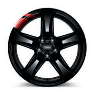
19" Black-Painted Aluminum with Red Accents (Standard on Redline Edition)