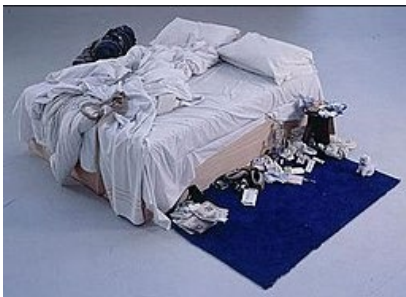
Figure 1. My Bed by Tracey Emin (Brown, 2006, p. 34)