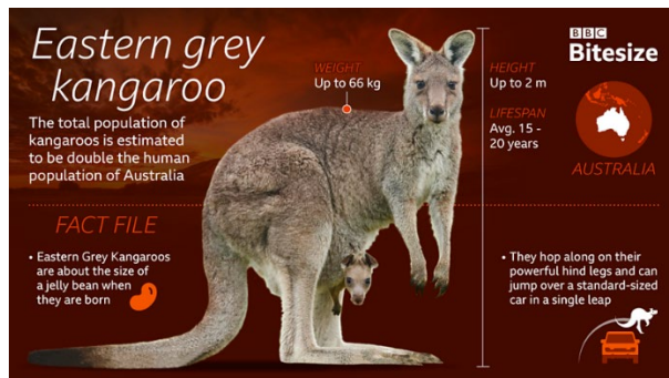
Figure 6. Eastern grey kangaroo fact file (BBC, 2019)