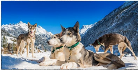
Figure 4. My weekend with the dogs! (Κλενγκελ, 2013)