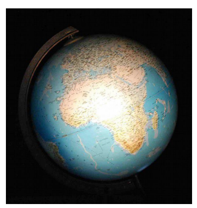
September 21<sup>st</sup>

Now repeat the 'walk' round the year, only this time, pause at each date and slowly rotate the globe. Ask pupils to observe the relative length of daylight and night time for their own latitude. Point out as many of the 'underlying principles' given below as would be appropriate for the age of the pupils.