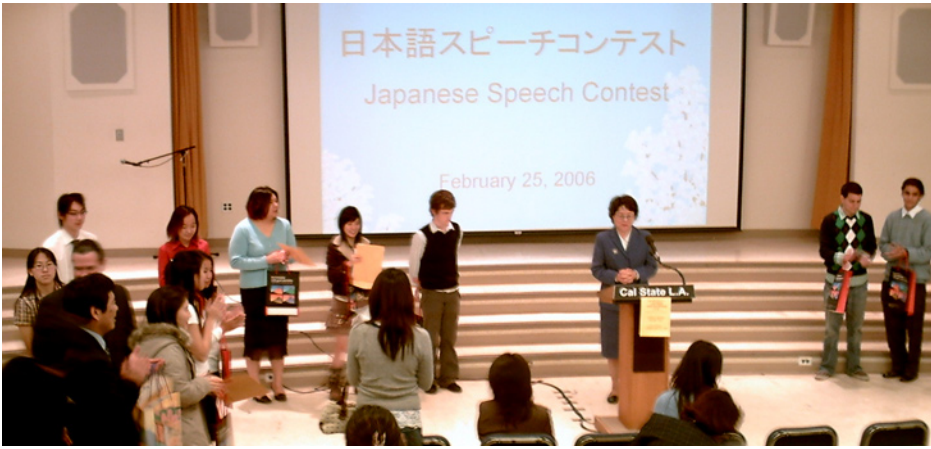
The Ninth Annual Japanese Speech Contest Award Ceremony