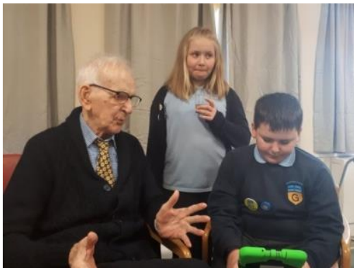
Griffithstown pupils showing a patient pictures of a Dakota he flew home injured from in WW2

Health Case Study: Following training by DCW, young people from Griffithstown Primary School supported a session at County Hospital in Pontypool (Aneurin Bevan University Health Board) exploring how engaging digital content can be used to help stimulate patients as they recover on the ward.