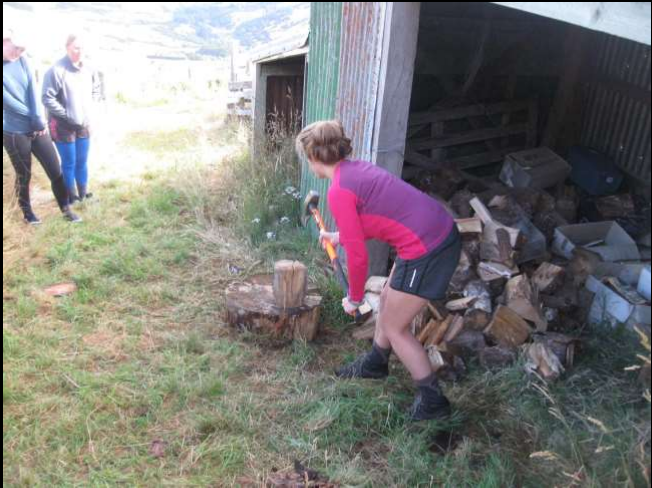
First experience of splitting wood