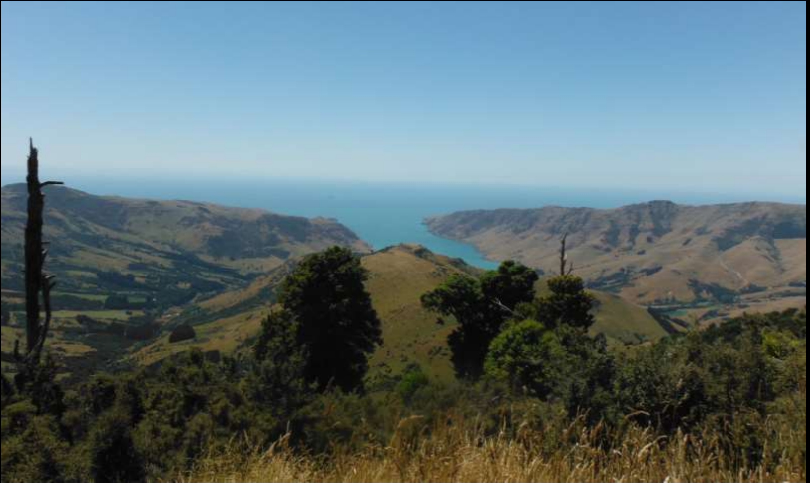
Looking toward Pigeon Bay