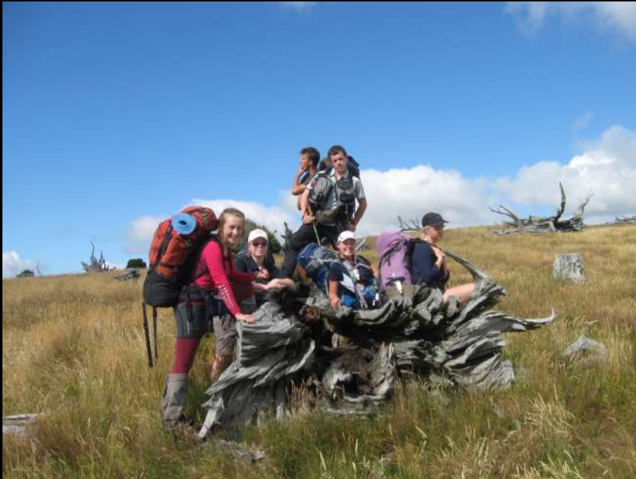
Totara graveyards of Waipuna Saddle