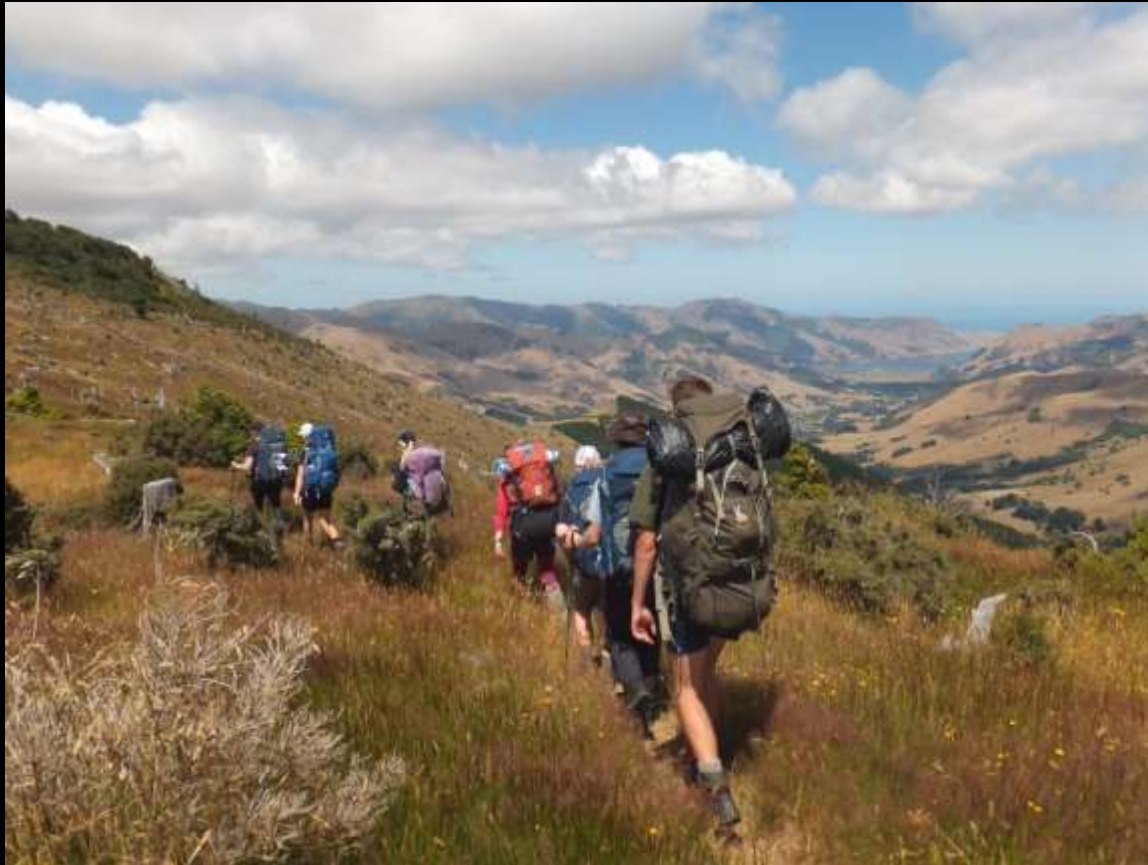
Looking toward Lake Forsyth