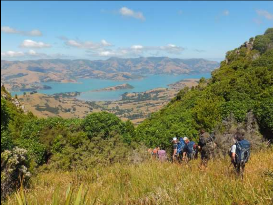
Descending toward Akaroa Harbour