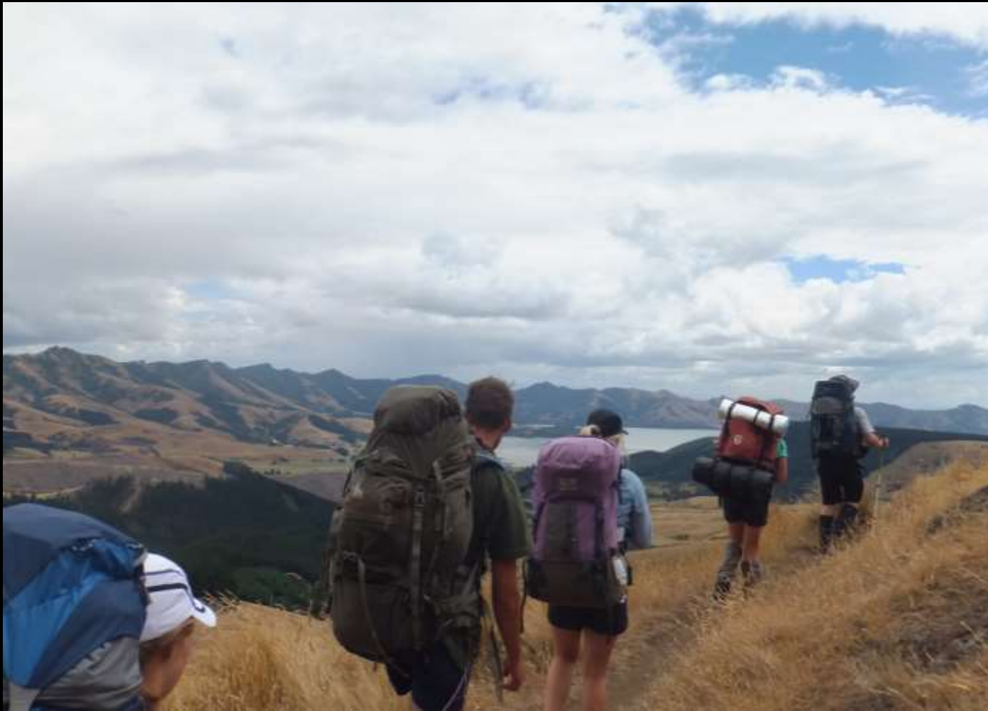
Views of Lyttelton Harbour