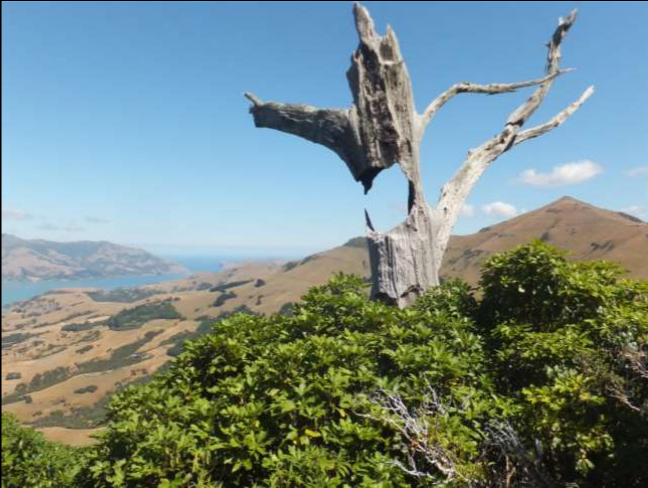
One last totara skeleton