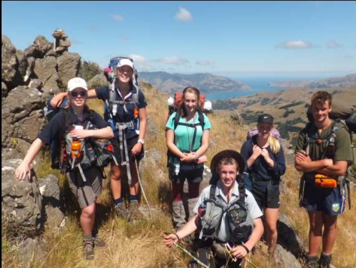
Rocky Peak Summit, Montgomery Reserve