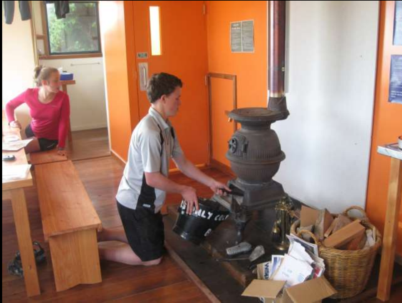
Preparing to light the pot belly