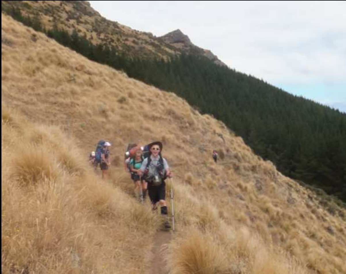
Emerging from pine forest to tussock land