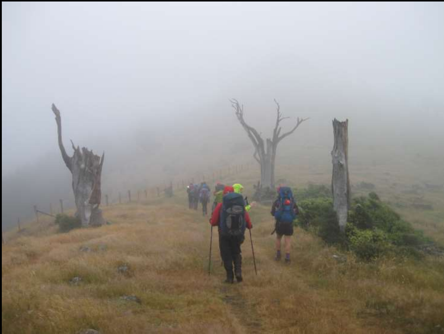
Totara skeletons loom from the mist