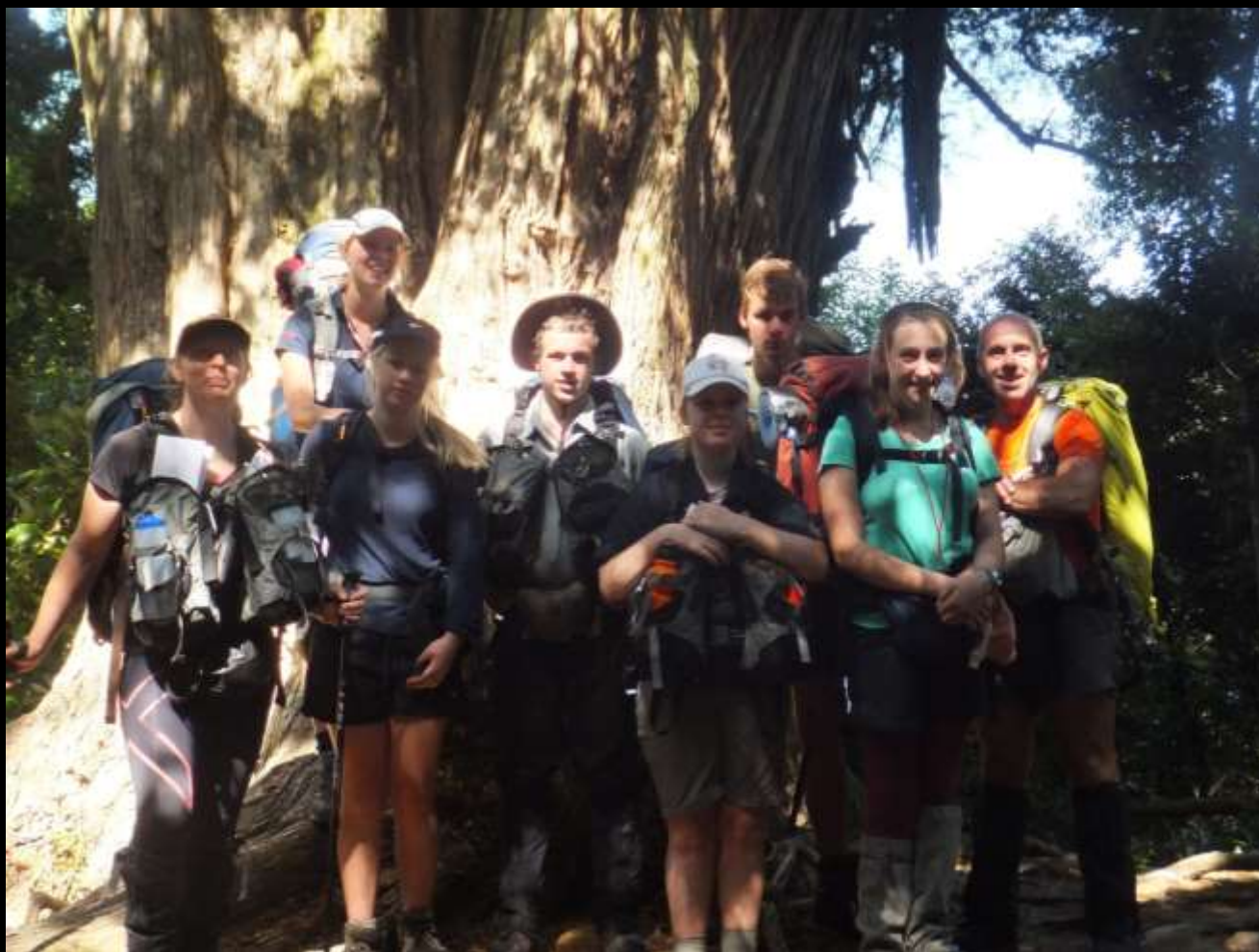
Living totara giant