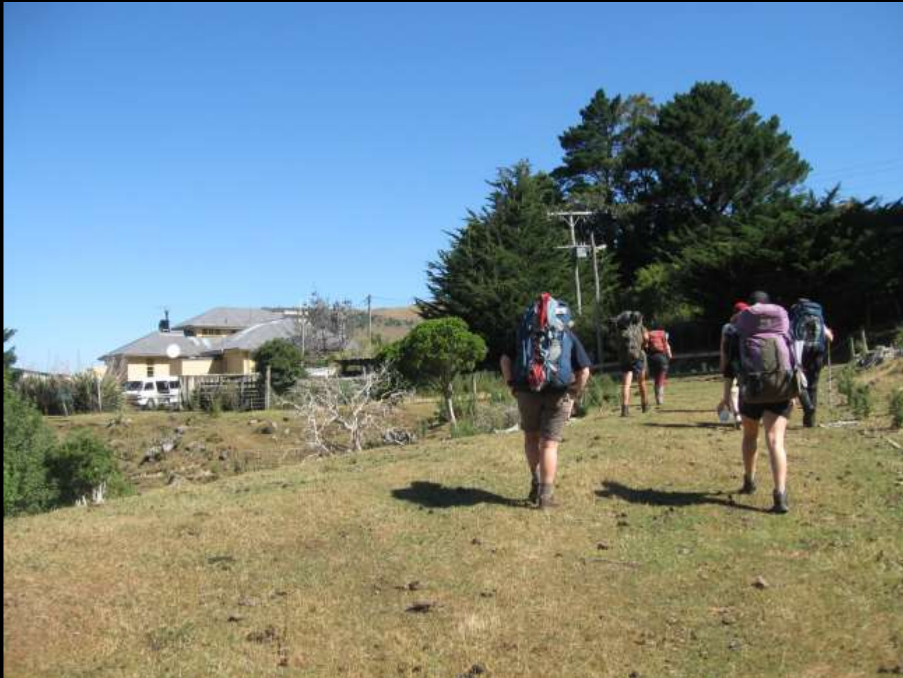
Crossing the paddock to Hilltop Hotel