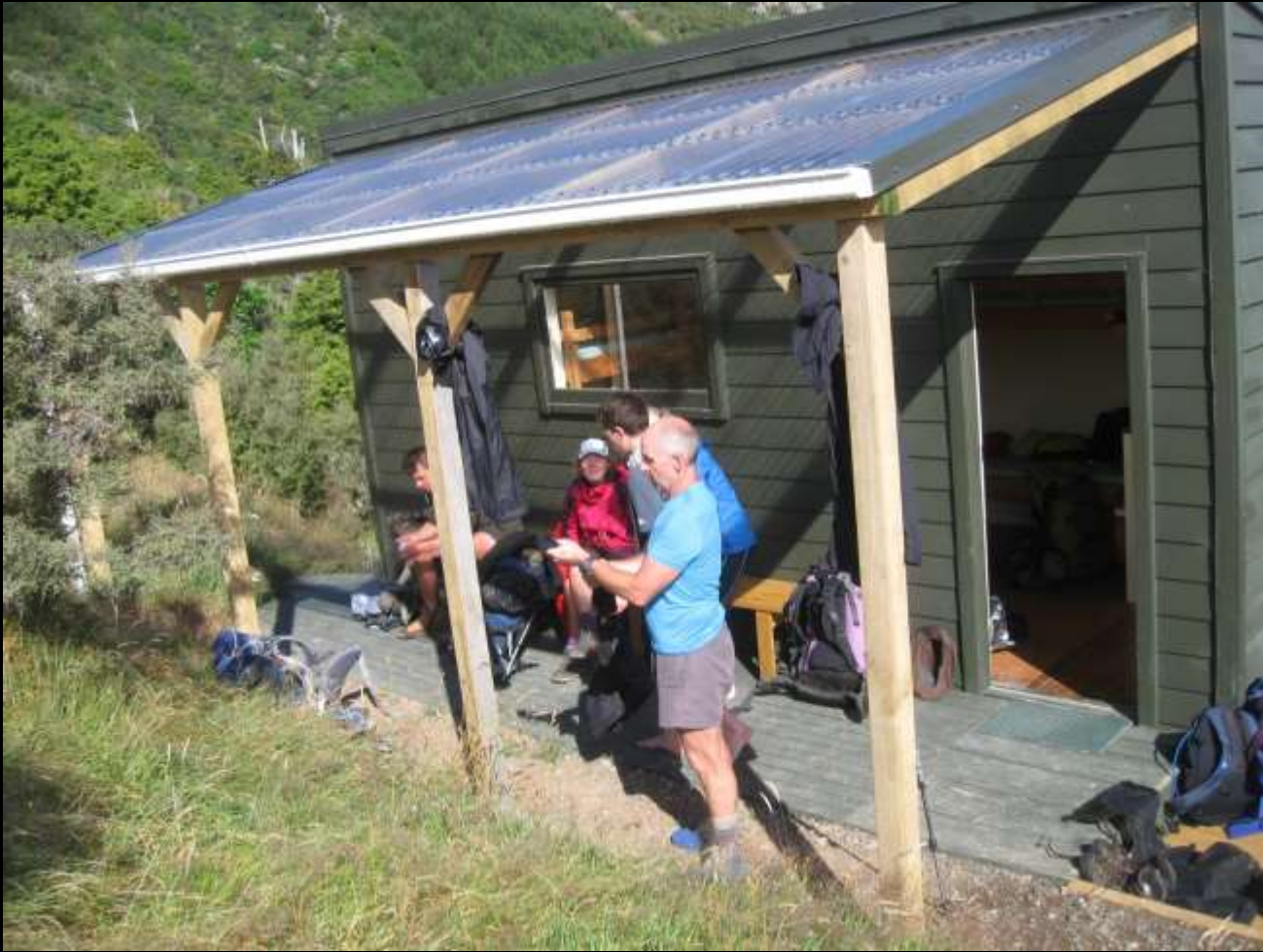
Sorting out damp gear