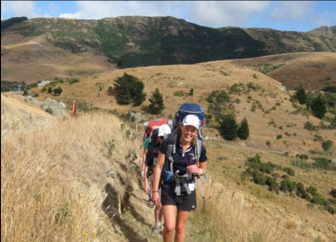
Departing from Gebbies Pass