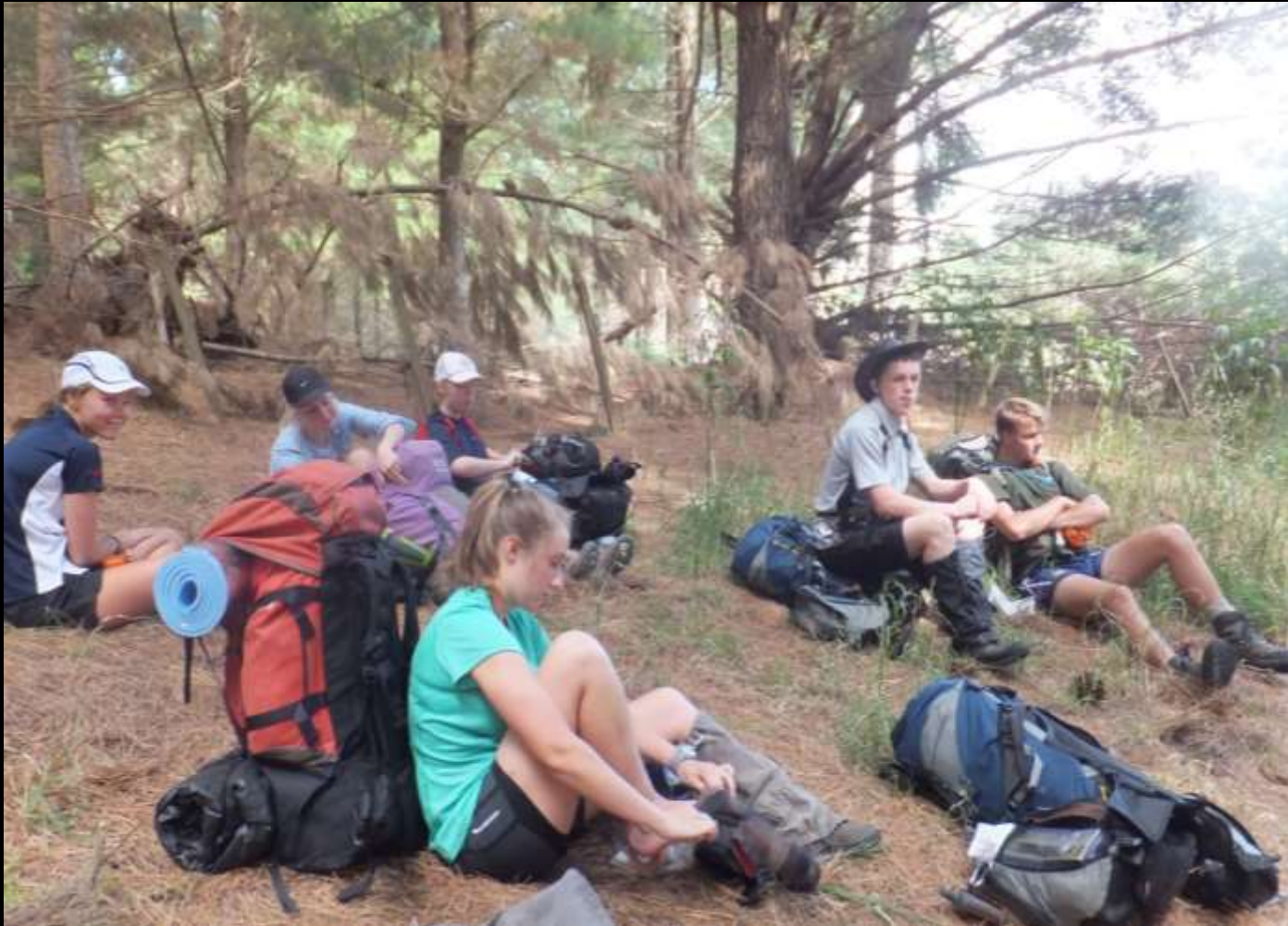
Rest stop in the forest