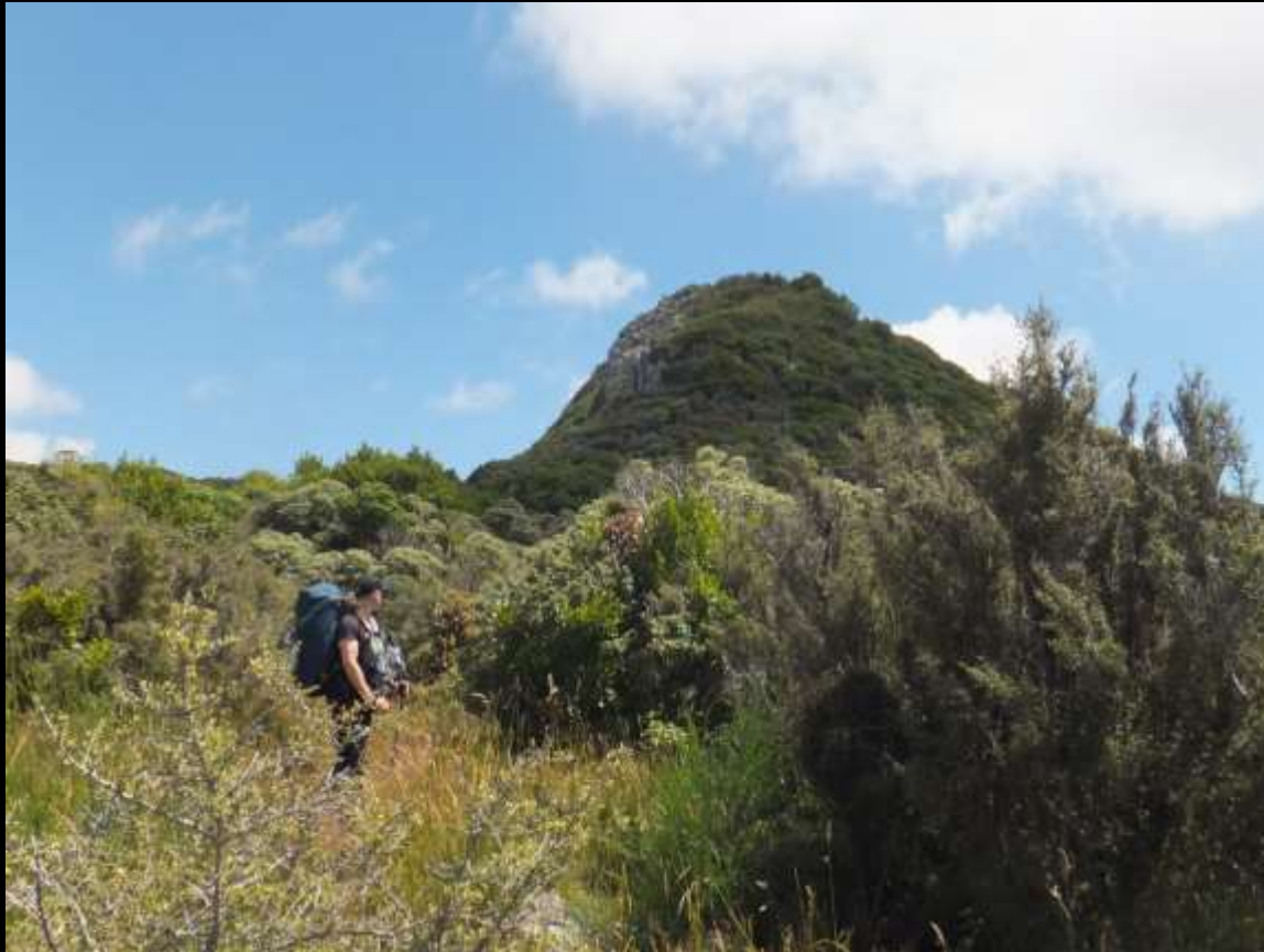
Looking back to Mt. Fitzgerald