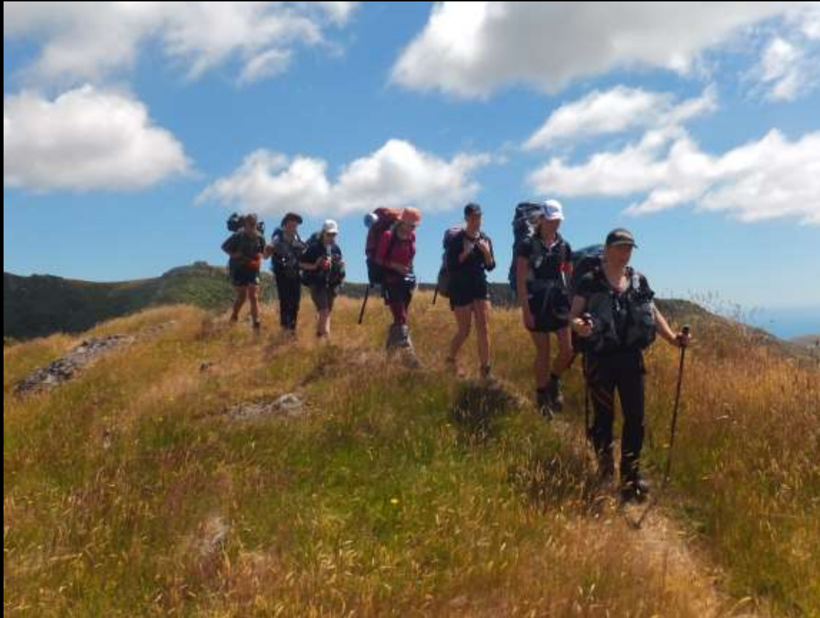
Heading to Mt Sinclair