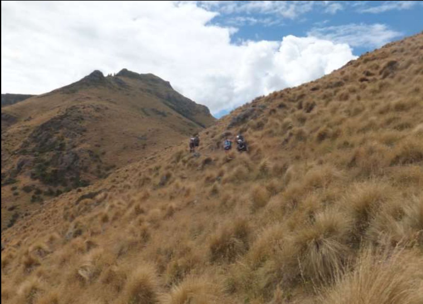
Mt. Bradley ahead