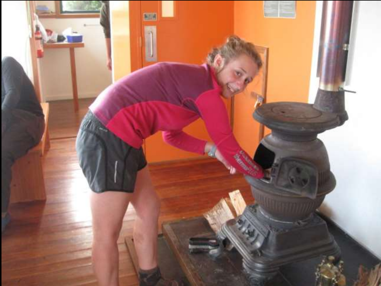
Lighting the pot belly