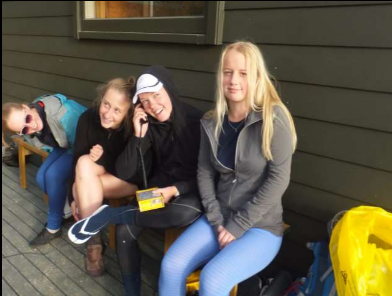
Listening to the weather forecast on mountain radio