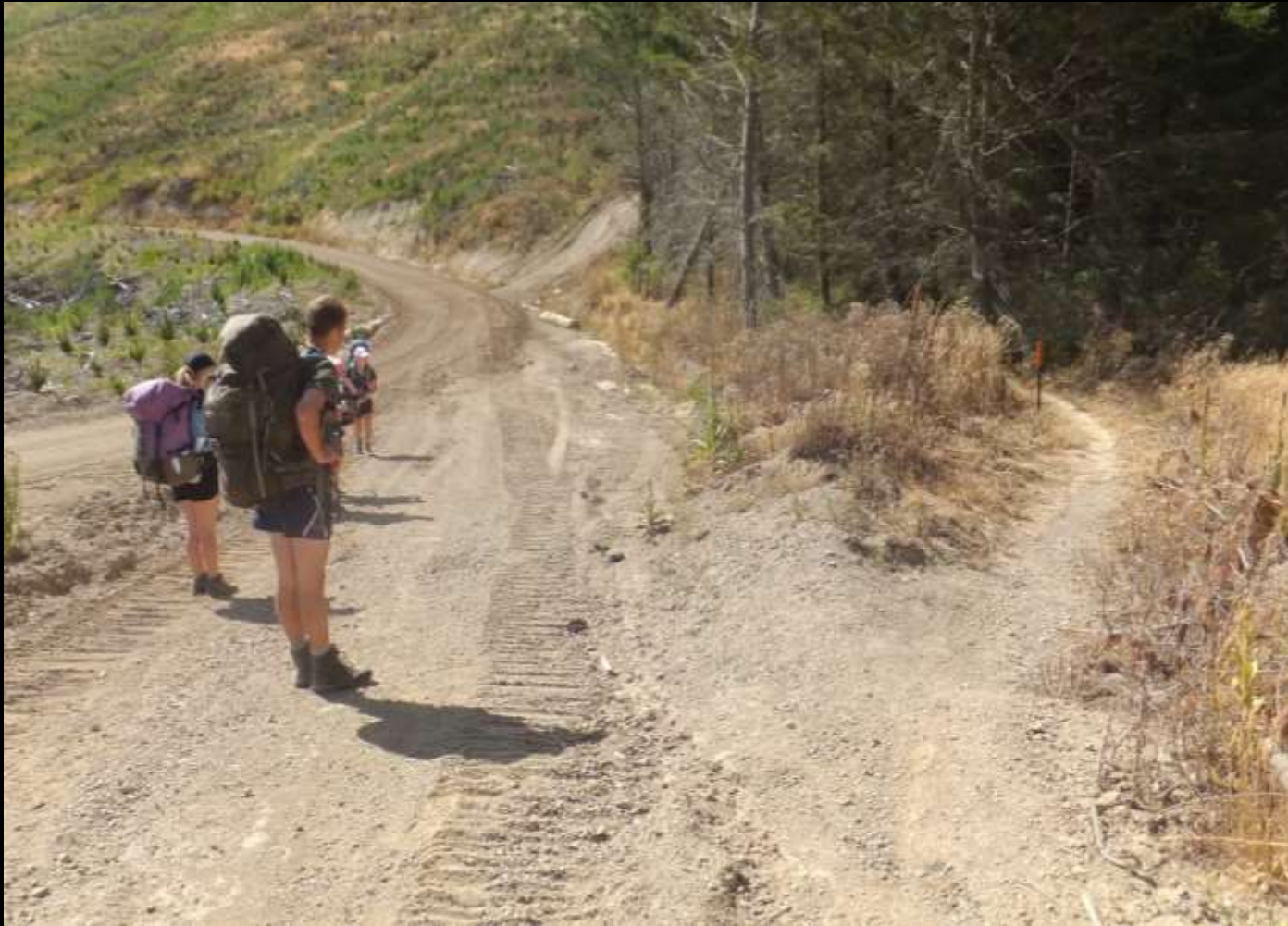
Spotting the track leaving the logging road