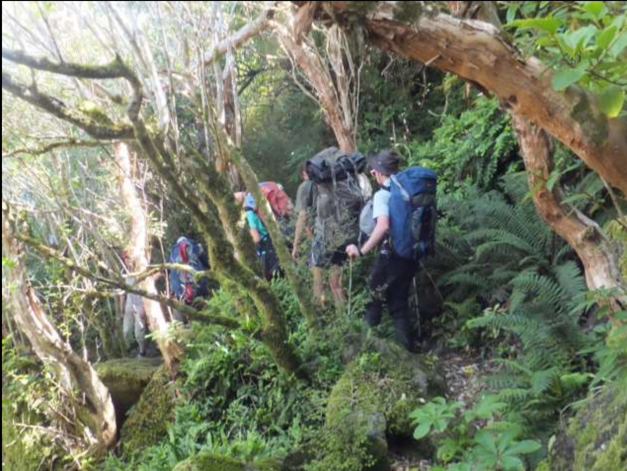
Lush bush in Montgomery Reserve