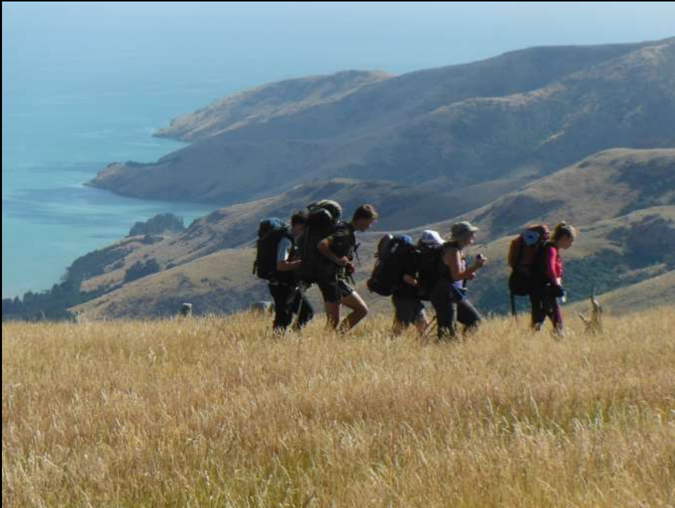
Striding onward above Port Levy