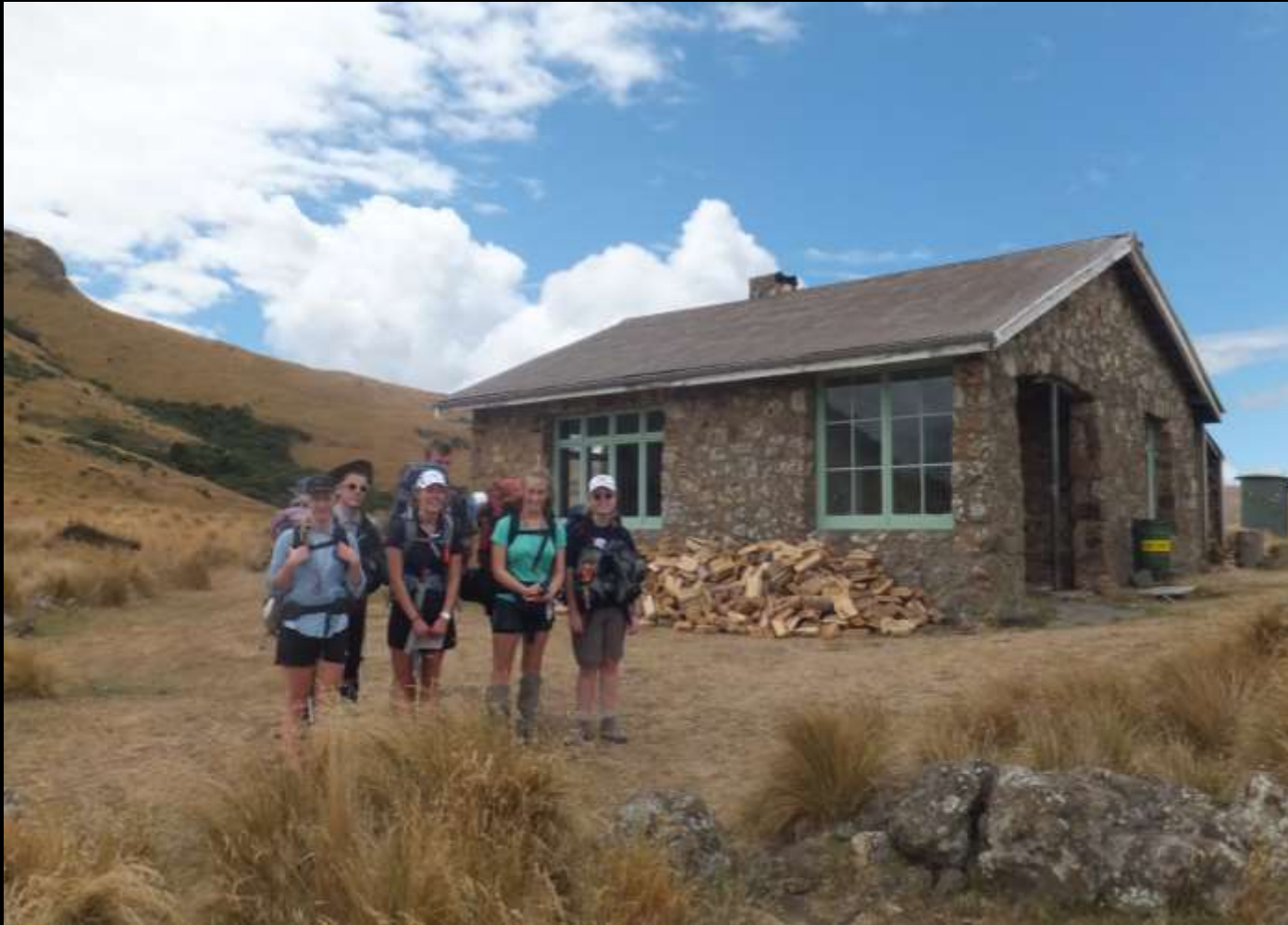
Arrival at Packhorse Hut