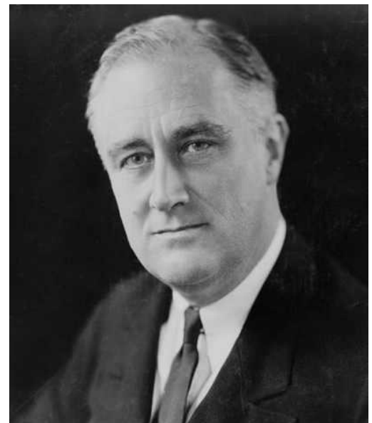
Franklin D. Roosevelt; 32 nd President of the U.S.