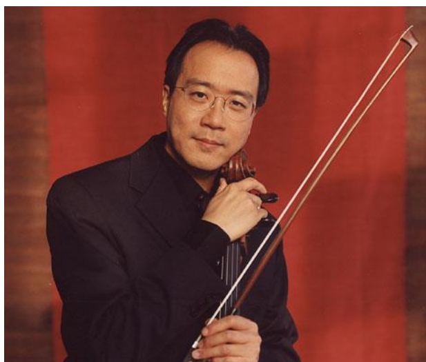
Yo-Yo Ma; American Cellist

-- Mikhail Gorbachev ( Russian Politician, Environmentalist, Social Activist, 1990 Nobel Peace Prize Winner; b. 1931 )