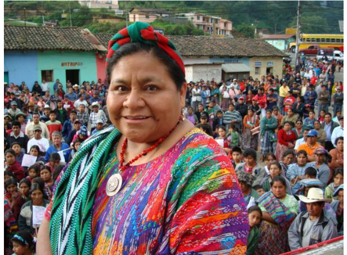
Rigoberta Menchú Tum; Guatemalan Indigenous Rights Activist

-- Rigoberta Menchú Tum ( Guatemalan Indigenous Rights Activist, 1990 UNESCO Prize for Peace Education, 1992 Nobel Peace Prize Winner ; b. 1952)