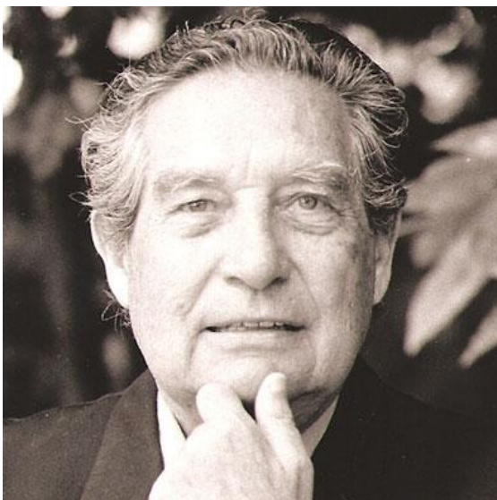
Octavio Paz; Mexican poet, writer and diplomat

-- Maya Angelou ( African-American Poet, Civil Rights Leader, National Women's Hall of Fame ; b. 1928)