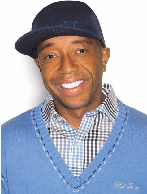
Russel Simmons; American Entrepreneur

15. "...if we are open and we prepare for promoting dialogue and love, and a better understanding of each other, and tolerance and so forth, that's what the world will become, a more tolerant, loving place."