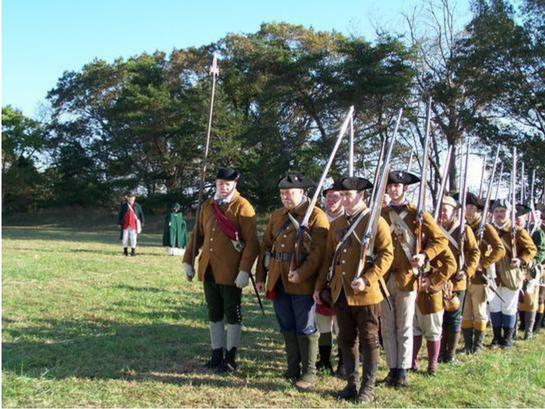
Massachusetts soldiers wearing bounty coats