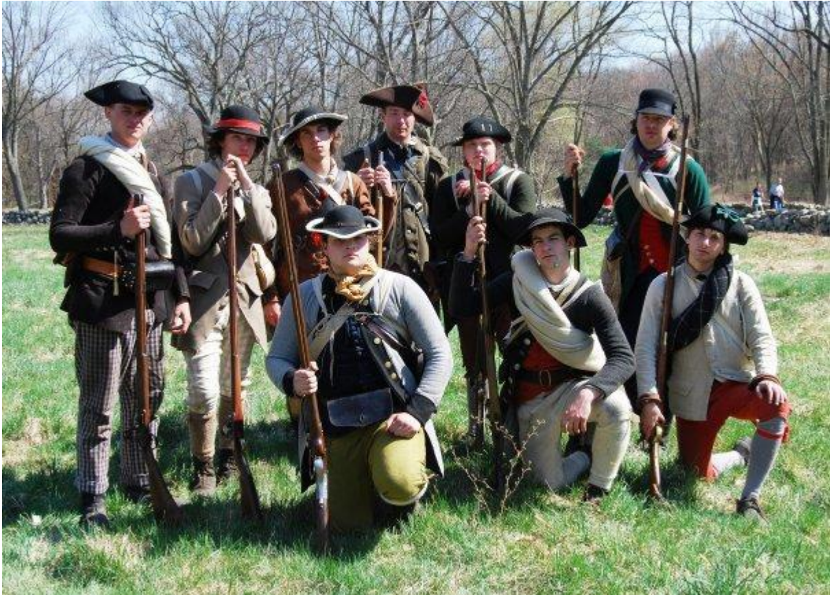
An assortment of militiamen wearing breeches, trousers, coats and jackets. Note how the jackets and breeches are tight yet not restricted