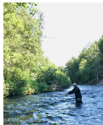
Fishing on the Russian River

Access Board meeting agendas, newsletters, forms, Board members listings and Plan summaries at the following address: http://www.muni.org/apfrs