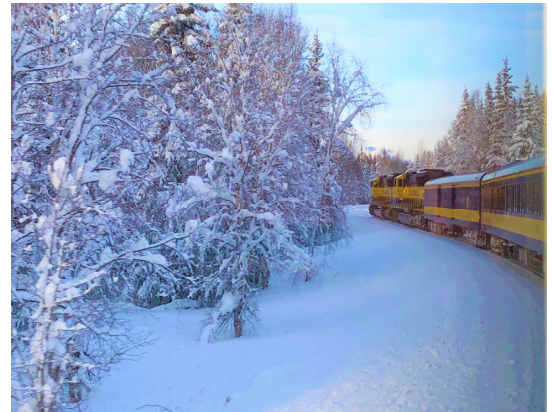
Alaska Railroad To Fairbanks