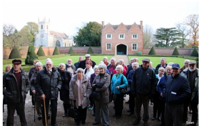
NARPO TRIP TO DODDINGTON HALL, NR.LINCOLN - 29 TH NOVEMBER, 2017.