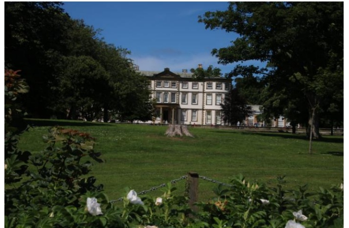
TRIP TO BRIDLINGTON AND SEWERBY HALL - 12 TH JULY, 2017.