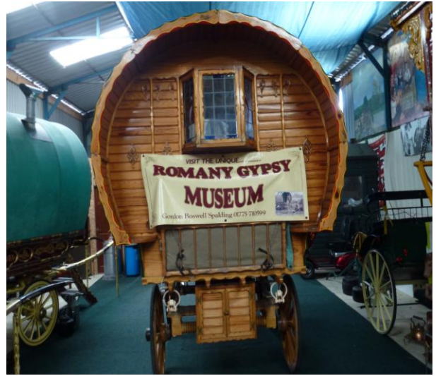
TRIP TO JAMES BOSWELL ROMANY GYPSY MUSEUM, SPALDING - 17 TH MAY, 2017.