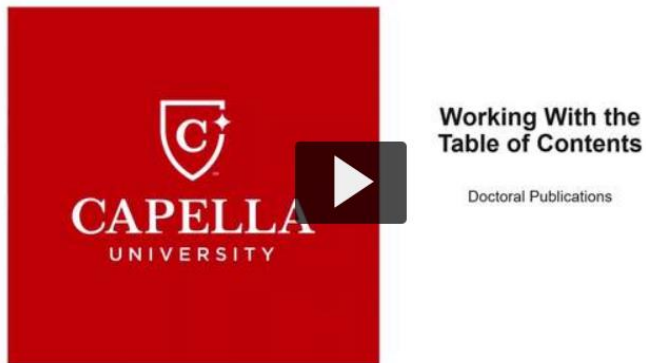
Table 6. What Should Be Entered in the Table of Contents?

Click the video below to learn more about updating the Table of Contents.