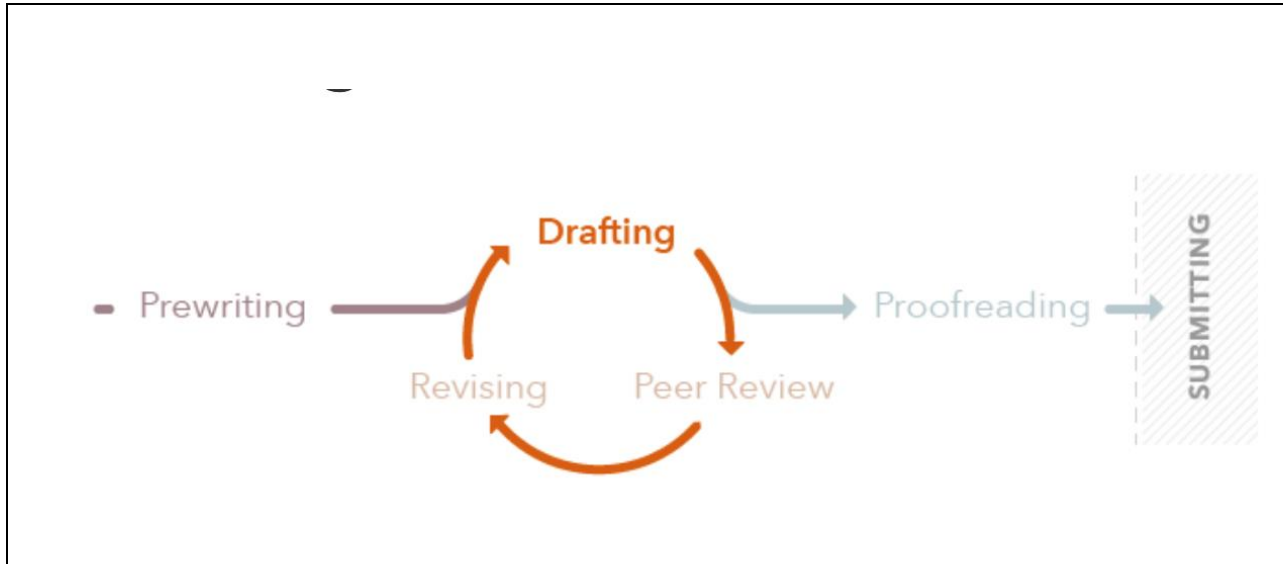
Figure 2. The Writing Process

The writing process is typically broken into four components: