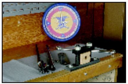
1. The original barreled action, new Adams & Bennett Savage varmint weight barrel, headspace gage, Wheeler Savage Barrel Nut Wrench and Barrel Vise.

To show how quick and easy it is to rebarrel a Savage rifle, we took photos of the actual procedure. The original rifle was a 30-06 with a standard weight barrel, and the decision was made to rebarrel it to 22-250 with a varmint weight barrel. Check the live clock in the background.