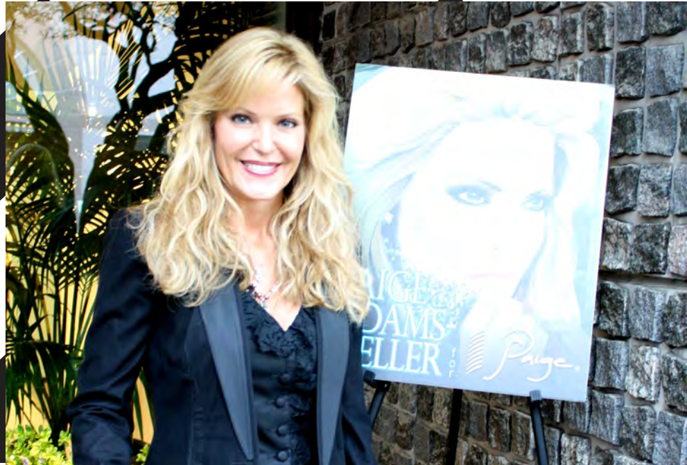
FIG Featured Guest Designers

In conjunction with offering some of the top showrooms and designers in the industry, FIG has also generated an opportunity for top designers to debut as our "Featured Guest Designer" during March and October markets. This is an opportunity for industry leaders to visit the FIG venue, meet buyers and experience FIG's market first hand. FIG hosts a cocktail party in honor of our featured designer, attended by tastemakers, buyers, media, and other fashion professionals.