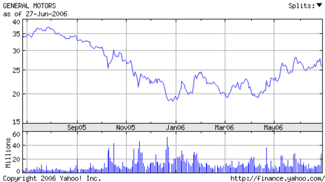
Figure 2: 1 year chart of General Motors Corporation

The chart shows below is the stock chart for this company, Figure 2. In this one year chart, you can see that the price shape was going down, and now is starting to climb back up. It might have a good chance to get back to its previous price, which is around 35.