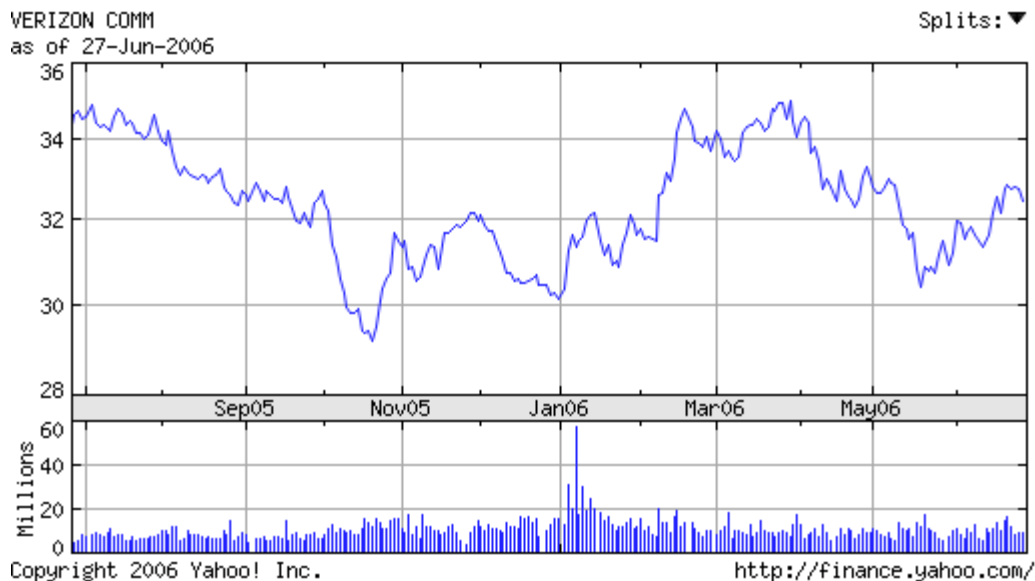
Figure 4: 1 year chart of Verizon Communications Inc.

In its 1 year chart, you can see that it has started to climb up from 31. If you invest now, you might still have chance to wait it hits 35, which is not bad.