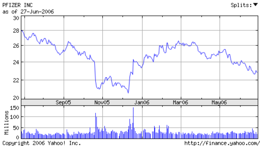
Figure 3: 1 year chart of Pfizer Inc.

In the chart, you can see that it has been going down for a while. It might start to climb back when it hits around 21.