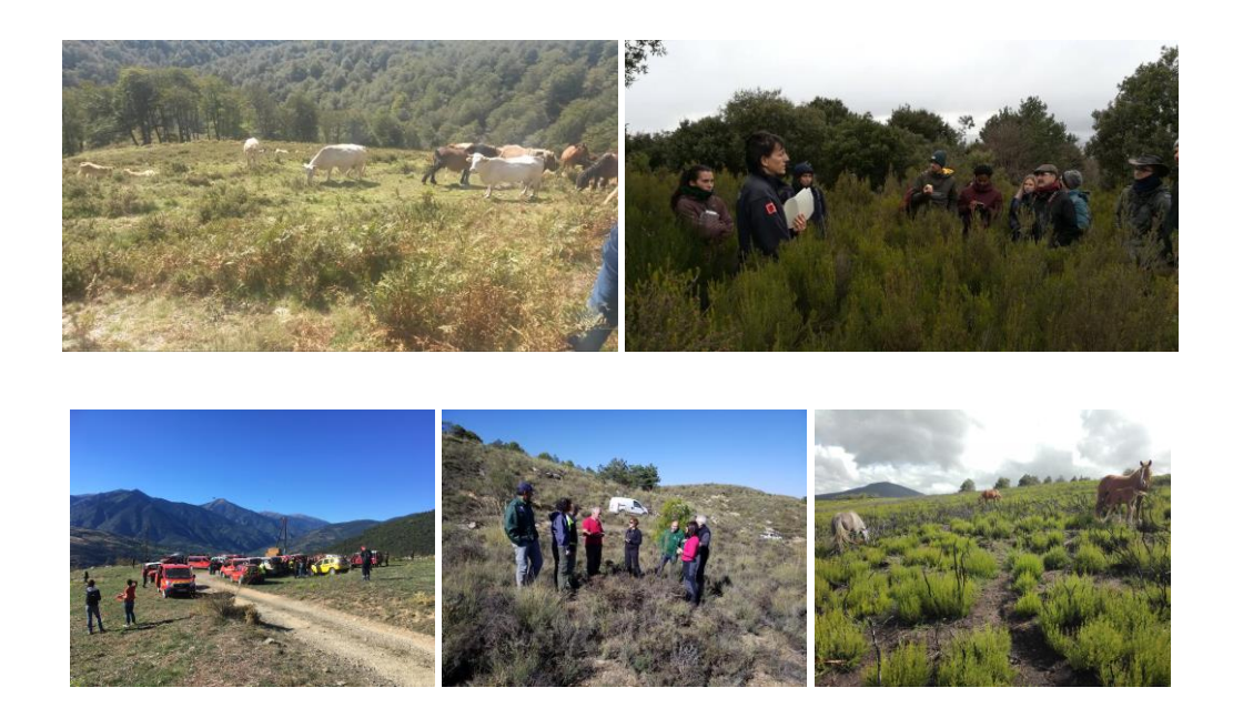
Figure 2: Some pictures of the pilot experiences established under the framework of the Open2preserve project.

cutting-edge technologies and pioneering valuation proposals-, achieve the economic sustainability and long-term viability of the management model.