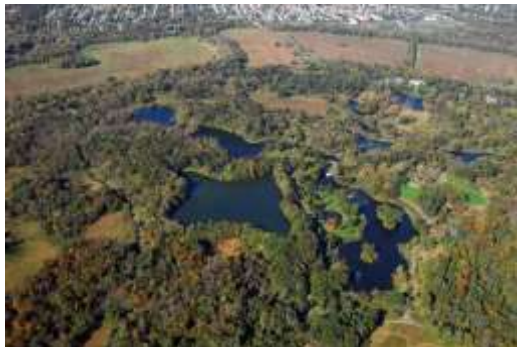
System of Lakes