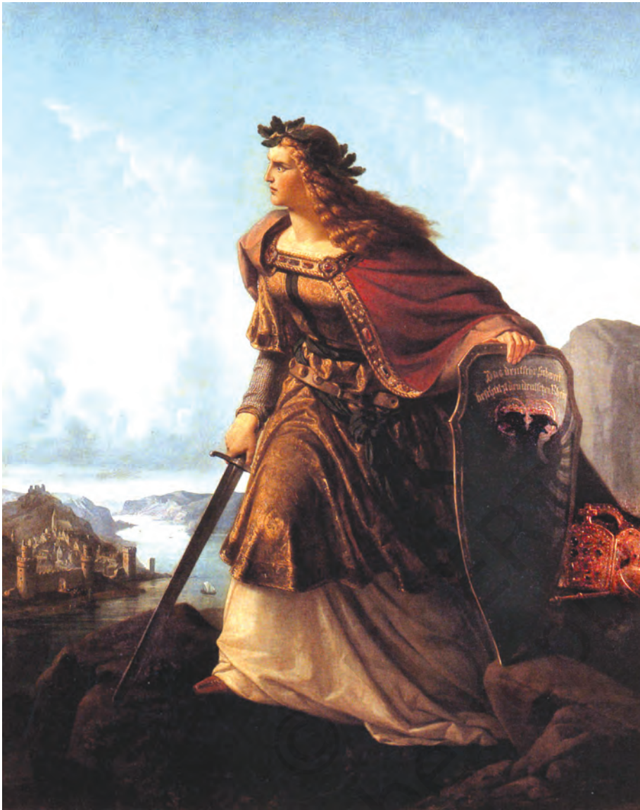
Fig. 19 — Germania guarding the Rhine. In 1860, the artist Lorenz Clasen was commissioned to paint this image. The inscription on Germania's sword reads: 'The German sword protects the German Rhine.'