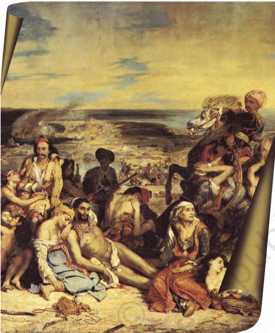
Fig. 8 – The Massacre at Chios, Eugene Delacroix, 1824.

The French painter Delacroix was one of the most important French Romantic painters. This huge painting (4.19m x 3.54m) depicts an incident in which 20,000 Greeks were said to have been killed by Turks on the island of Chios. By dramatising the incident, focusing on the suffering of women and children, and using vivid colours, Delacroix sought to appeal to the emotions of the spectators, and create sympathy for the Greeks.