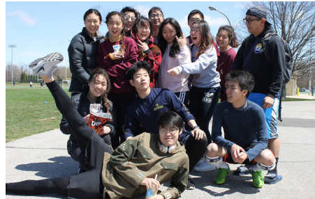
SPRING SPORTS DAY