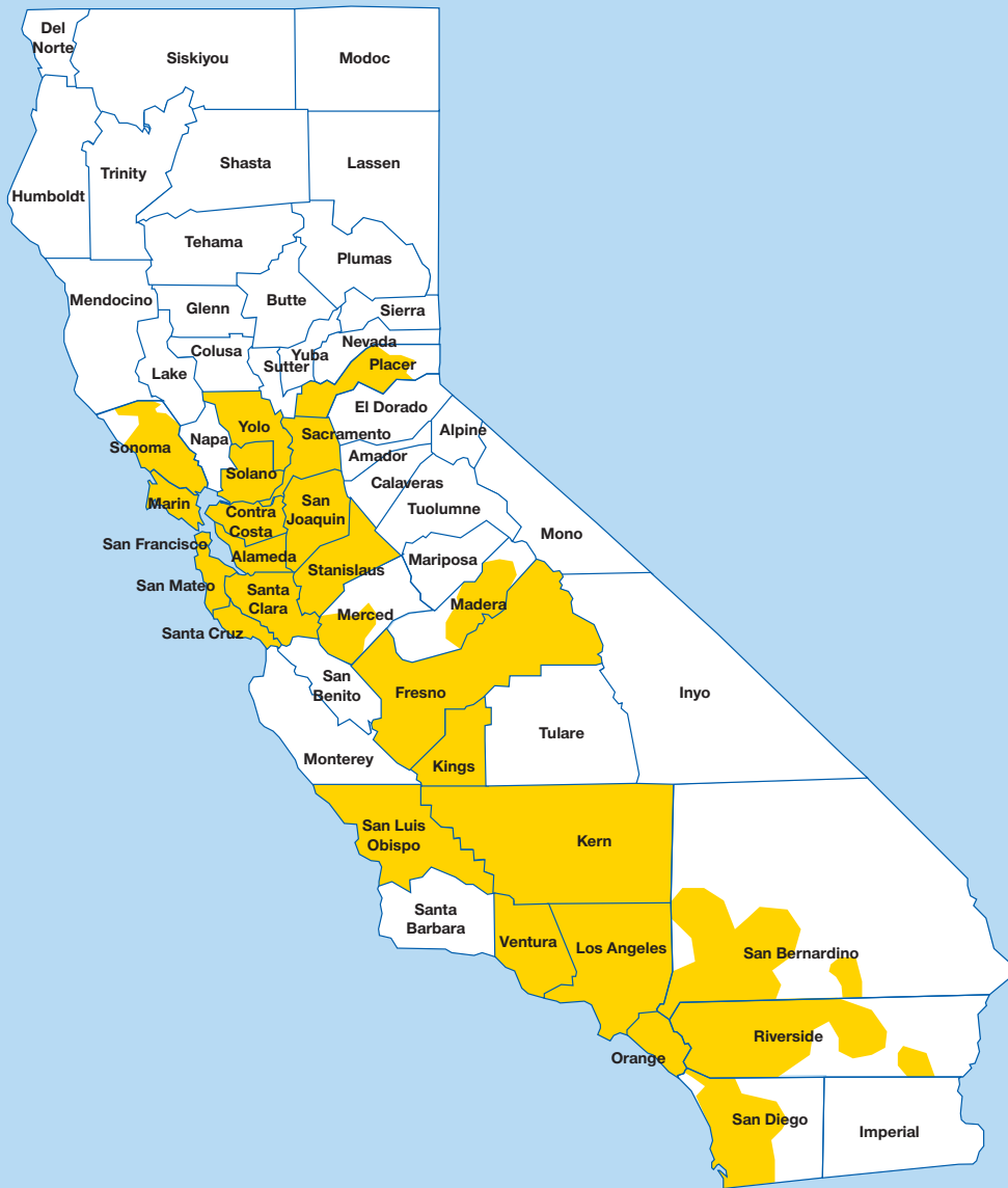
■ UnitedHealthcare Alliance Service Area 6