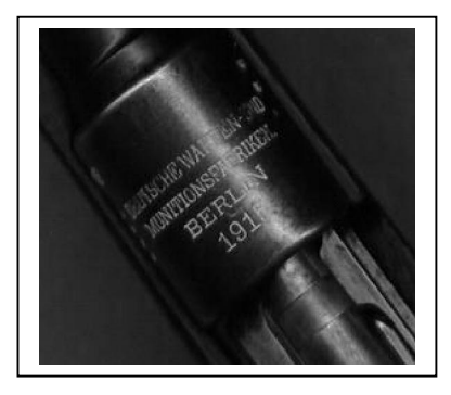
1916 DWM Gewehr 98