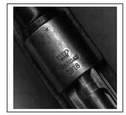
1916 Spandau Stern Gewehr

Imperial Gew98's will NOT have a blued receiver or bolt, and will all have the Lange sight.