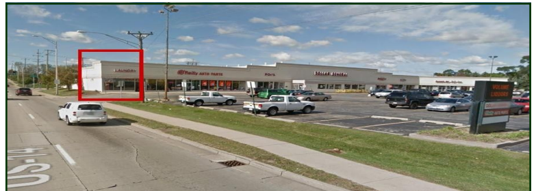
FOX VALLEY QUICK WASH COIN LAUNDRY