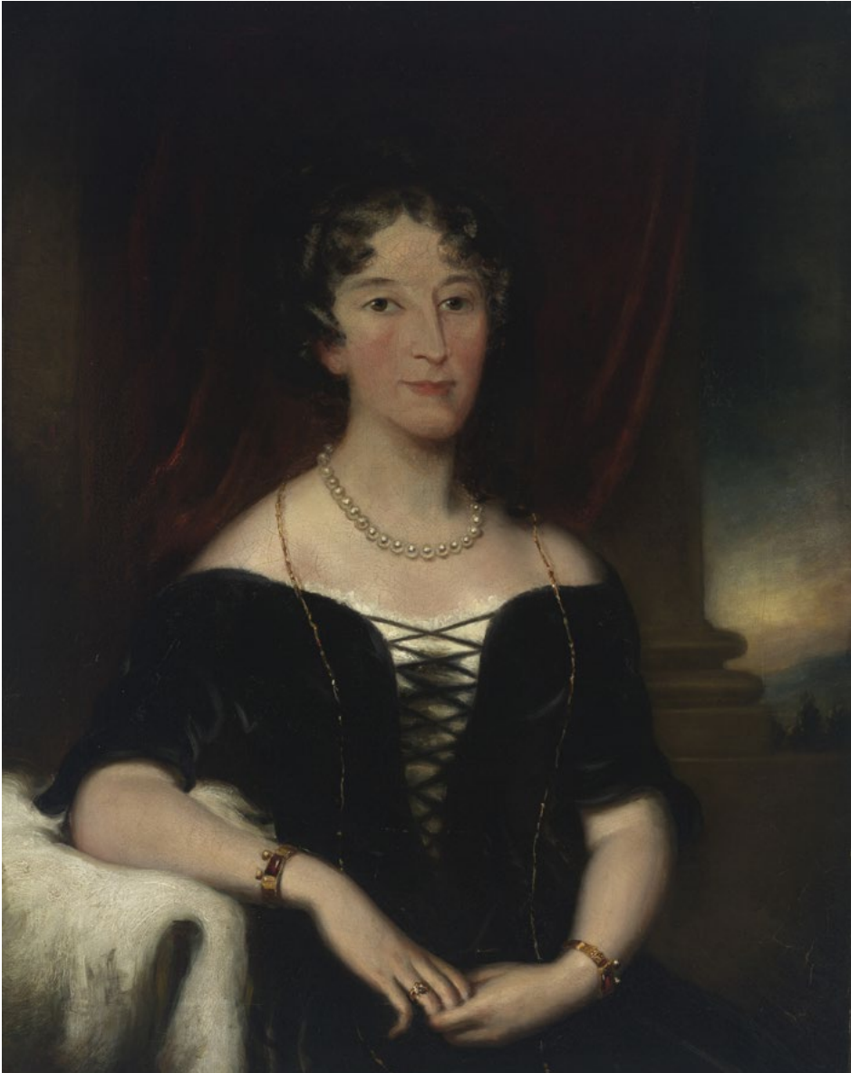
Plate 67 Unknown artist: Elizabeth Macarthur (n.d., ca 1850s). Authenticated portrait. Oil on canvas; 90 x 70.5 centimetres.