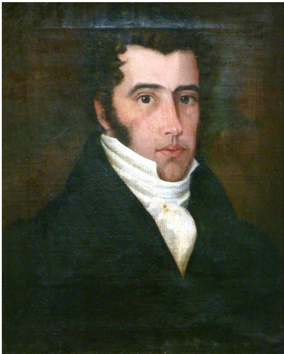
Plate 68 Unknown artist: John Macarthur (?) (n.d.). Unauthenticated portrait.