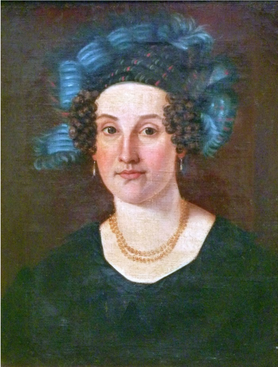
Plate 69 Unknown artist: Elizabeth Macarthur (?) (n.d.). Unauthenticated portrait.