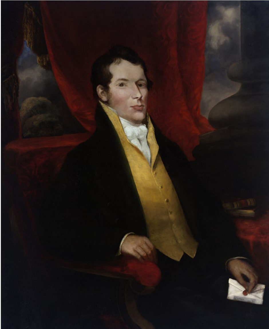
Plate 66 Unknown artist: John Macarthur (n.d., ca 1850s). Authenticated portrait. Oil on canvas; 125 x 100 centimetres.