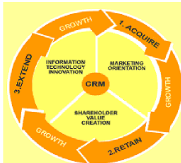
Business Strategy and CRM

We now consider the Business Strategy Perspective on CRM. Here, we propose a model, which is a hybrid, and typical of many of the models and diagrams of CRM that you will find on The Internet and in popular books on the topic of e-marketing/ecommerce. The model has three key phases and three contextual factors: