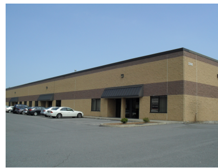
STAFFORD AVENUE BUSINESS PARK LEASING PLAN