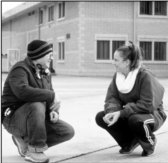
Dominic Savage with Tamzin Outhwaite

Director Dominic Savage is renowned for his true-to-life portrayals of young people in Britain today, following the success of both Nice Girl and When I Was 12 , and it was his work on the latter which gave him a glimpse of young offenders and spurred him to make Out Of Control . “My experience on When I Was 12 , which touched on youth crime, gave me an insight into that area. It seemed like the obvious subject to tackle next.