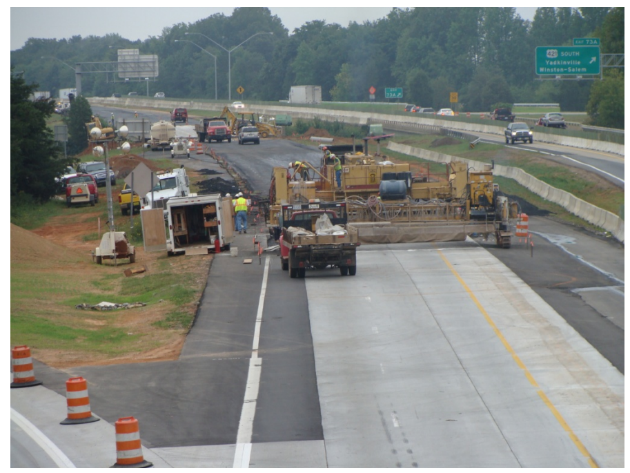
unbonded concrete "white topping" overlay

Lastly, concrete pavement can be used for LEED construction. Permeable concrete helps control pavement run-off, provides root space and irrigation for trees and plantings, and controls surface transported pollutants. All concrete pavement aids the heat sink in controlling high temperatures unlike other pavement types. Light-colored pavements (concrete vs. asphalt) reflect sunlight rather than absorbing solar heat. Communities can lower average temperatures by replacing pavement types as a temperature controlling device. An additional benefit of the light reflection is better night-time lumination. Business developments and communities can reduce energy costs from reduced air conditioning needs and reduced lighting for similar visibility. Also concrete has been shown to help clean the air by bonding chemically to automobile exhausts and rendering the emissions inert. TX Active "pollution eating" concrete is also self-cleaning and returns to a white finish even after staining with organic and inorganic pollutants.