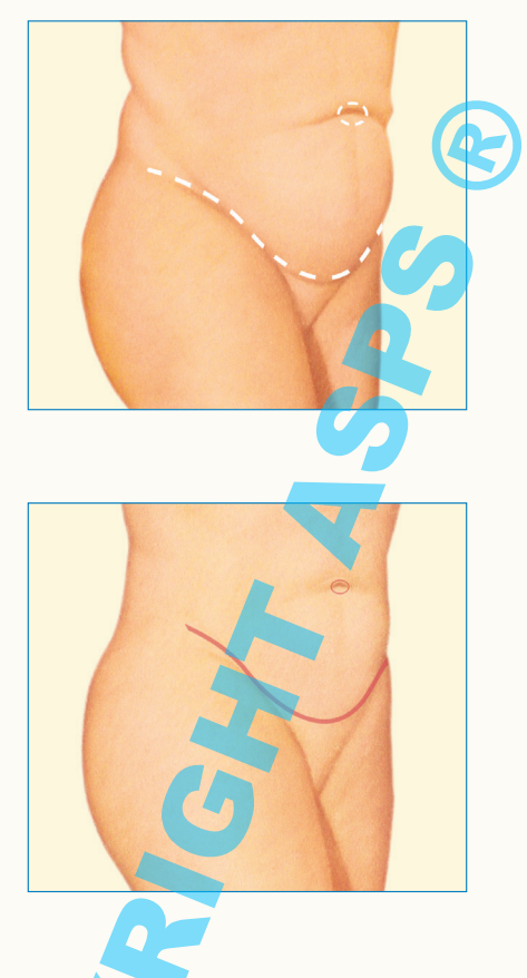
Step 3 - Closing the incisions

Sutures, skin adhesives, tapes or clips close the skin incisions.