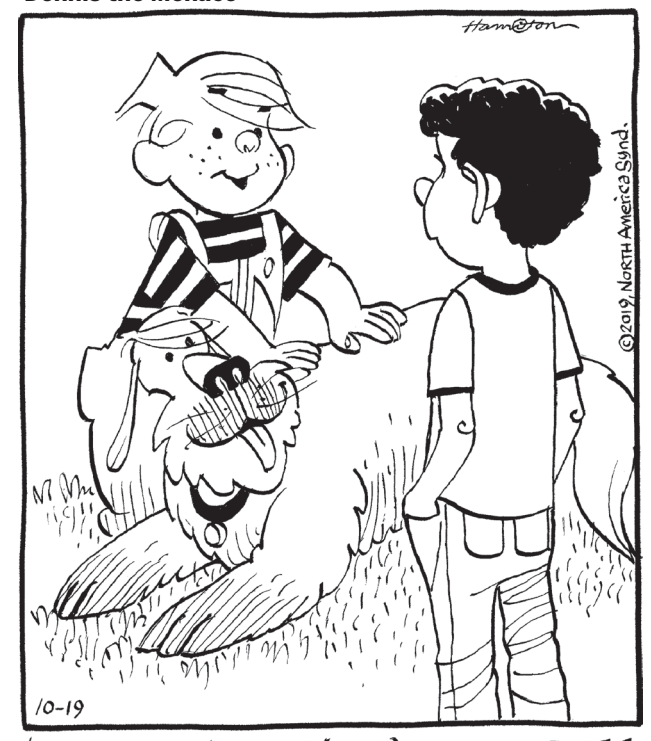
HE SAID BOW-WOW, I GUESS RUFF WOULD HAVE A DIFFERENT NAME!?