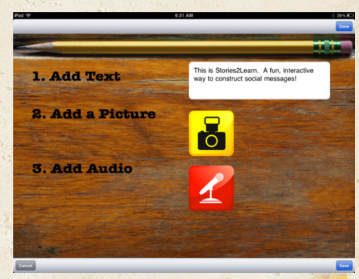
Creating a Story