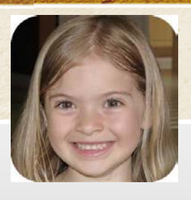
• $49.99 Available o