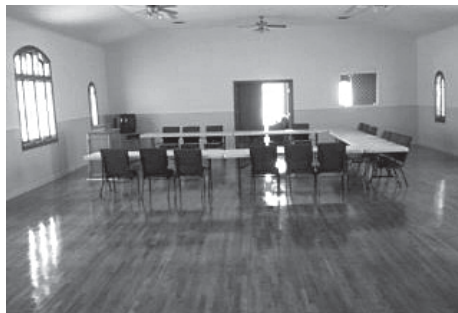
The finished product: a beautifully restored floor

During the restoration project, Kevin said nearly 20 volunteers from the three rehabilitation centers worked on the floor. He said the carpet had been on the