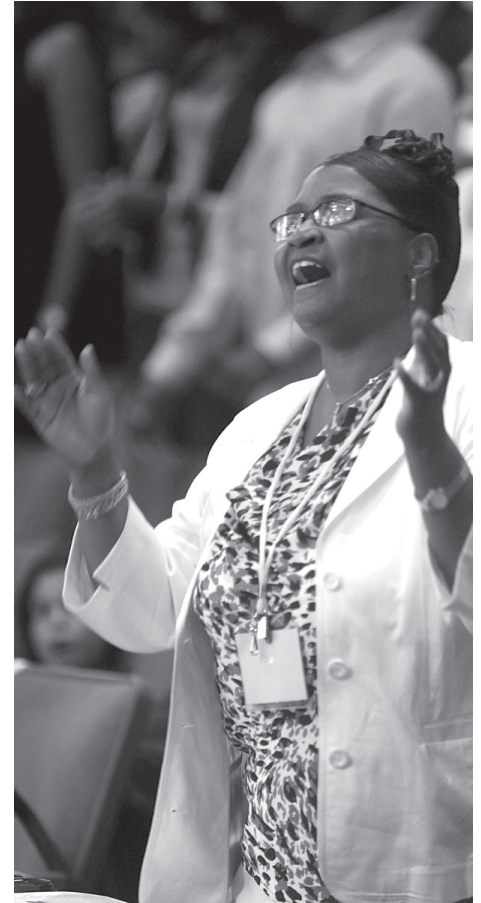
Worshiper at NAC 2011