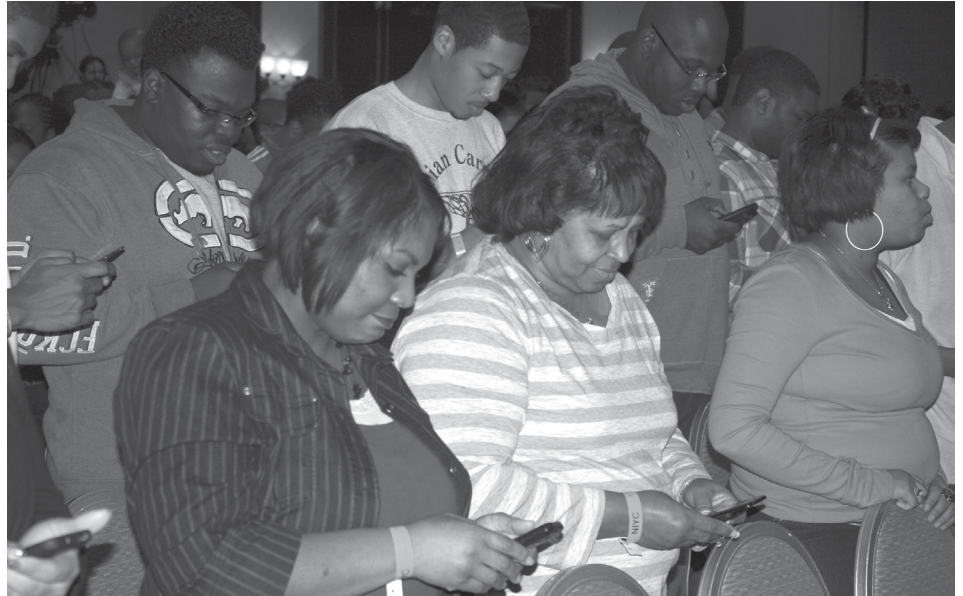
Participants were asked to Facebook their NIYC experience during Wednesday evening’s worship service.