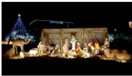
Daystar's Life-Sized Nativity Scene

Our culture works hard to take Christ out of Christmas, which means that we, as Christians, need to work even harder to share the real reason for the season – Jesus' birth! This year, we are excited to be able to do this in a tangible way here on property through a life-size nativity scene display –