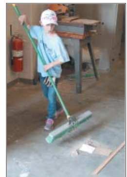
Families of LyondellBasell employees even got into the act during Global Care Day such as this young girl who grabbed a broom and began sweeping the Construction Trades shop at Channelview High School.