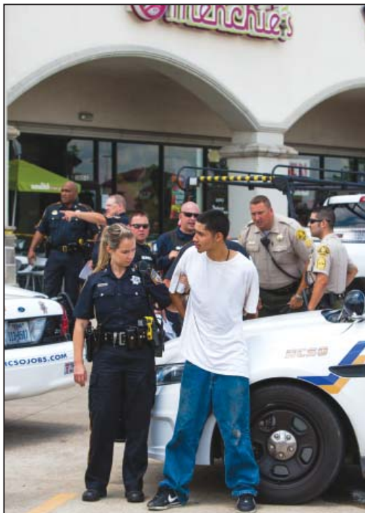
DEPUTIES ARREST the second suspect in front of the GameStop store on Wallisville, the site of a robbery and shooting.