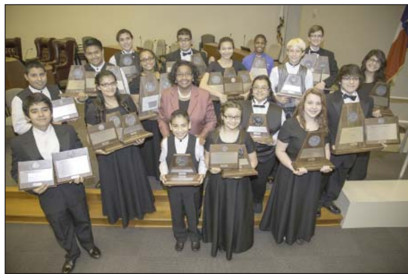
Some of the students in the band and choir programs.

Supreme dedication and countless hours of hard work pay off as GPISD choirs & bands have a banner year at the UIL Concert & Sight-reading. 2014 results are as follows: