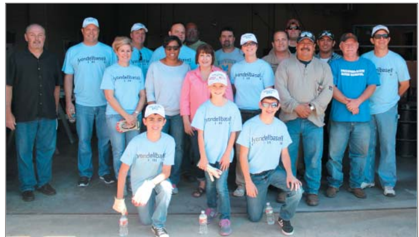
Volunteers with Channelview High School, LyondellBasell and Austin Industrial all teamed up to organize the CHS vocational shops during LyondellBasell's Global Care Day.

The vocational shops at Channelview High School are newly organized, thanks to the efforts of some volunteer muscle during LyondellBasell's 15th annual Global Care Day. Employees from LyondellBasell's Channelview Complex and some of their family members, along with volunteers from Austin Industrial hauled off old and unused materials, organized work areas for better use and gave the shops a clean appearance. Career and Technical Education (CTE) teachers from CHS rolled up their sleeves in assisting with the efforts. The "Shop Work Day," as it was called, brought a new