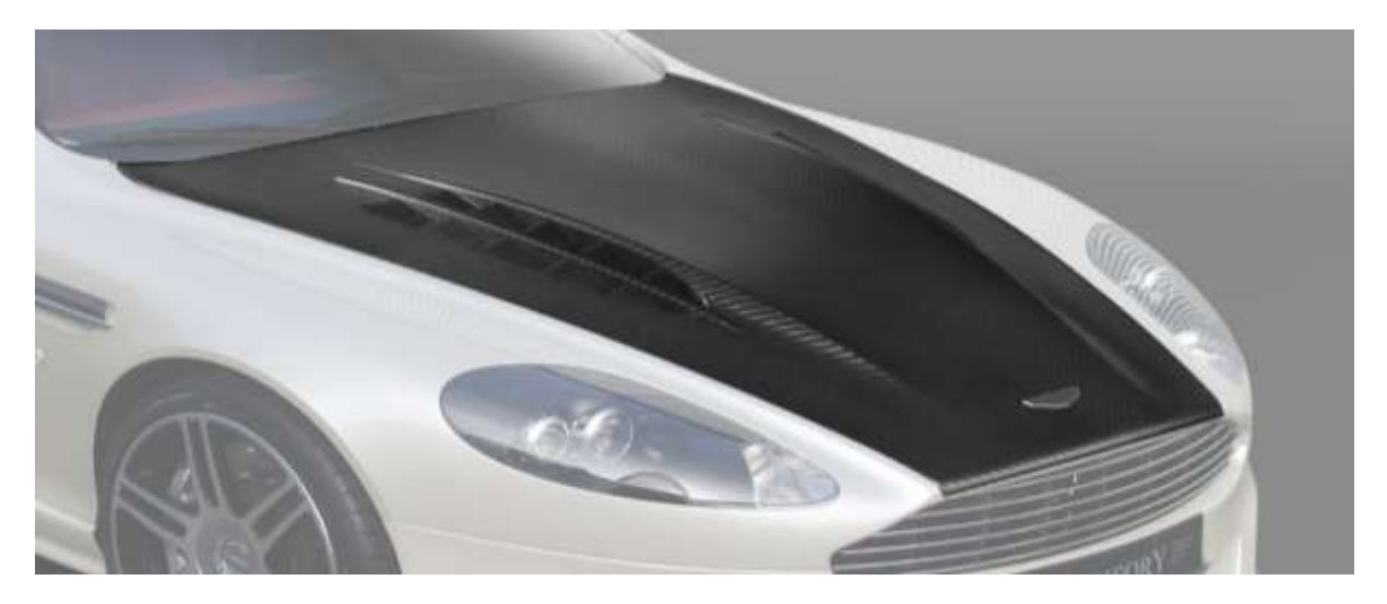
Engine Bonnet Exposed

Primed not visible carbon fibre without clear coat, with integrated air outtakes visible carbon fibre primed without clear coat