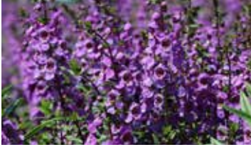
Angelonia (annual). These come in different colors.

Here are some of the flowers and plants that will do well in the summer heat and will survive around our rabbit population. Below are just a few of the superstar plants in Texas. Give them a try!