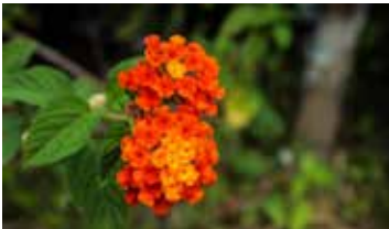
Texan Lantana or New Gold Lantana (perennial). Many colors.

For more information on Texas Superstars visit :