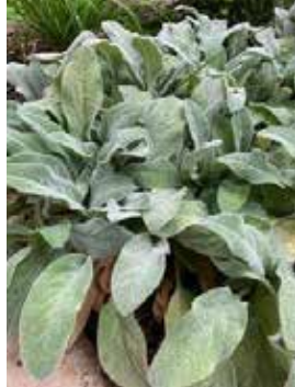
Lamb's Ear (perennial).