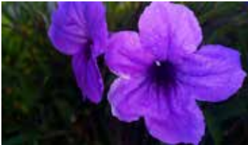
Mexican Petunia (perennial)