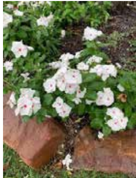
Vinca (annual) White, Pink, Red.