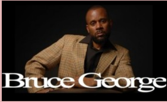
~ Director of Business Development