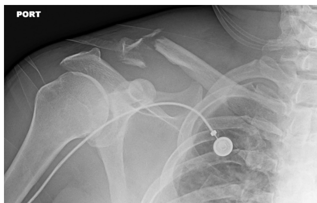
Figure 1. 48-year-old male with complex acromioclavicular separation. Rockwood Type IV clavicle fracture with severe comminution of the distal fracture fragment and associated acromioclavicular and coracoclavicular joint separation. There is also a displaced fracture of the 3rd rib.

Intraoperatively, the distal clavicle was found to be quite scarred inferiorly due to his previous fracture, and no CC ligaments were attached to the inferior tubercle. The distal clavicle fracture was reduced and maintained in place by a temporizing Steinmann pin (Fig. 2A). A drill guide was used to place a hole through the central third of the clavicle into the base of the coracoid, a pin was placed through the clavicle and coracoid to check positioning, and this was over-reamed with a cannulated 4mm drill bit (Fig. 2B). Then, reconstruction of the coracoclavicular separation