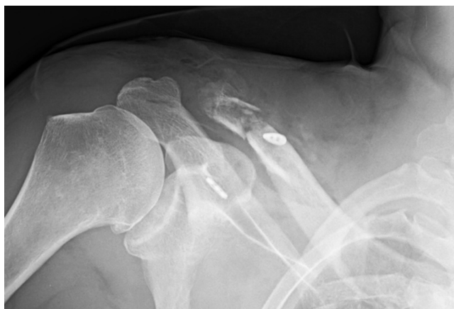
Figure 2C. 48-year-old male with complex acromioclavicular separation. The reduction is maintained by the TightRope following removal of the Steinmann pin.