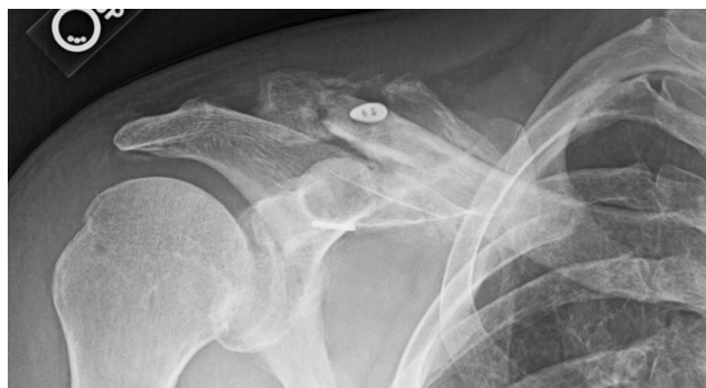
Figure 3. 48-year-old male with complex acromioclavicular separation. At 6 weeks, the CC joint remains reduced with the TightRope in place. The clavicle fractures are healing.

The use of rigid fixation with pins and screws is associated with complications such as hardware migration and fracture and/or loosening, which is compounded by the loss of normal joint movement. In addition, a second operation may be needed to remove hardware (1, 5-7, 9, 10). The advantages of the more recent techniques include the preservation of normal joint function, minimal scarring, faster recovery time, and a reduction in risk of coracoid fracture (1, 8).