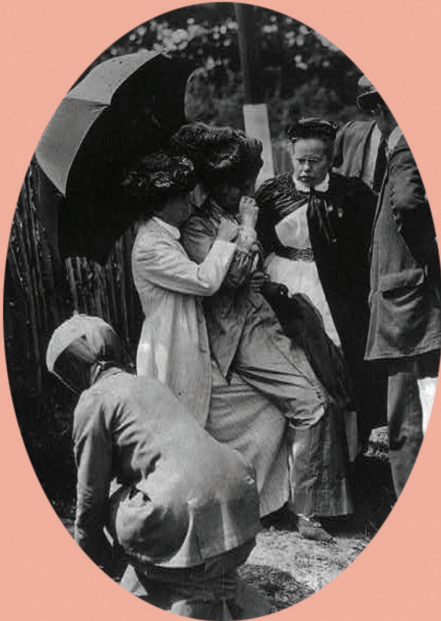
Pankhurst seated on lap of woman holding umbrella, facing right; at time of her re-arrest, May 26, 1913.

honourable peace for the combatants; and that is what we have been doing. We entirely prevented stockbrokers in London from telegraphing to stockbrokers in Glasgow and vice versa: for one whole day telegraphic communication was entirely stopped. I am not going to tell you how it was done. I am not going to tell you how the women got to the mains and cut the wires; but it was done. It was done, and it was proved to the authorities that weak women, suffrage women, as we are supposed to be, had enough ingenuity to create a situation of that kind. Now, I ask you, if women can do that, is there any limit to what we can do except the limit we put upon ourselves?