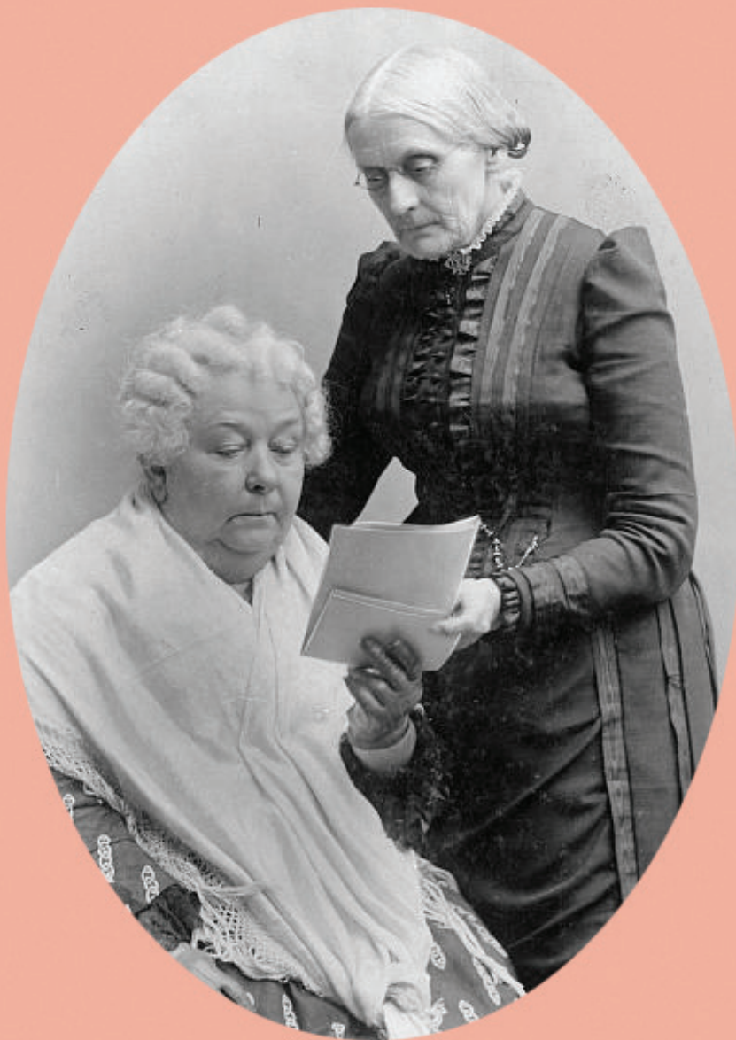
Stanton, seated, with fellow suffragette Susan B. Anthony.

hardships in jails, prisons, asylums, the horrors of war, cruelty, and brutality in every form, all this would be mere sentimentalizing. To protest against the intrigue, bribery, and corruption of public life, to desire that her sons might follow some business that did not involve lying, cheating, and a hard, grinding selfishness, would be arrant nonsense. In this way man has been molding woman to his ideas by direct and positive influences, while she, if not a negation, has used indirect means to control him, and in most cases developed the very characteristics both in him and herself that needed repression. And now man himself stands appalled at the results of his own excesses, and mourns in bitterness that falsehood, selfishness, and violence are the law of life.