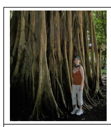
Chalchuapa, El Salvador Ceiba Tree

Fall Office Hours: Mondays/Wednesdays: 9:30 am – 10:30 pm & 12:20 – 1:50 pm