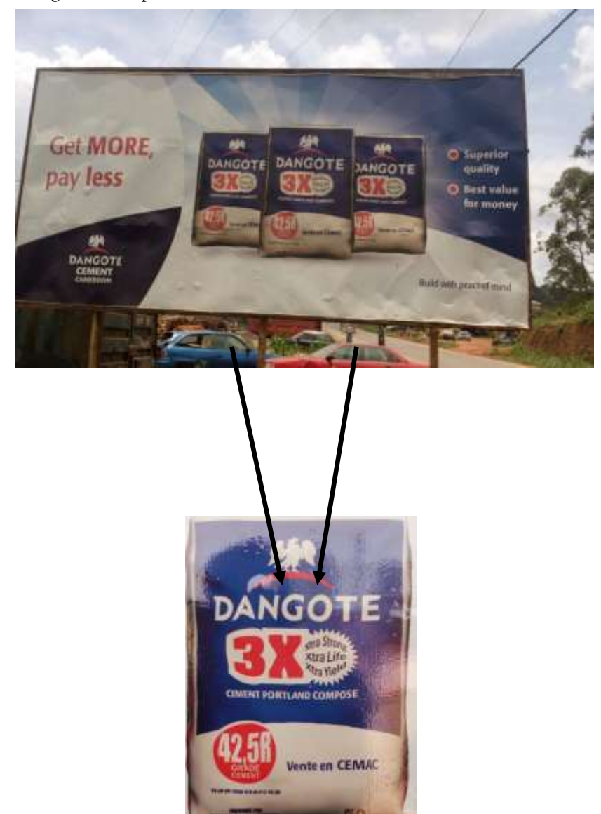
Figure 2. Dangote Cement billboard in Bamenda, North West Region, Cameroon.

With the above in mind, this study is going to analyse the advertisement of the Dangote Cement, found on billboards in Bamenda, North West Region, Cameroon. The analysis will use as tools the Textual Conceptual Functions as given by Jeffries, (2016) and explained by <u>team@languageinconflict.org</u>. It will focus on what is communicated and how it is communicated and how it is interpreted. In analysing the linguistic structures and discourse strategies in the light of their interactional (even though passive) and wider social contexts, this study will uncover ideologies and social meanings expressed in Dangote Cement advertisement using the following apparatus: prioritisation, implying and assumption, listing, naming and description.